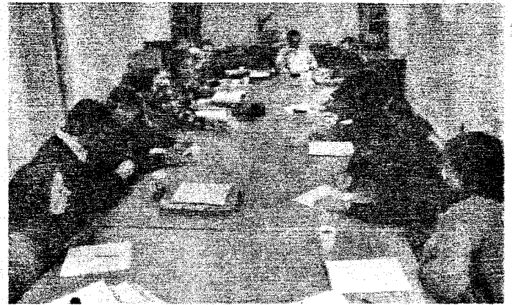
Faculty and students in a Department meeting