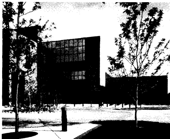
Law School Archives