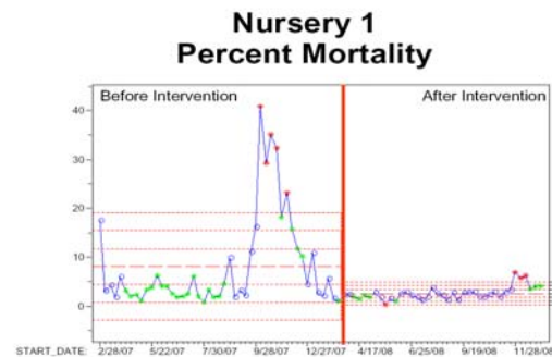
Figure 2. Farm 2 pig mortality rates the first 8 weeks post-weaning before/after intervention.