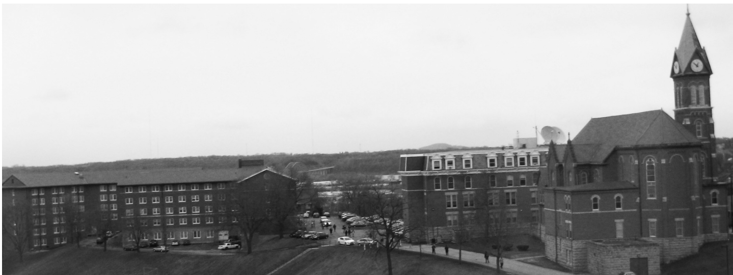
Loras College, where the Midwest ILL Conference was held

The second Midwest Interlibrary Loan Conference was held April 11, 2008, on the beautiful campus of Loras College in Dubuque, Iowa. Turnout was very good, with 90 attendees representing eleven states. Some attendees came from as far as Vermont and Arizona.