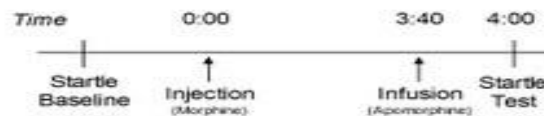
Fig. 2 Apomorphine infused into BNST does not attenuate withdrawal induced startle

Injection is a subcutaneous injection of morphine or saline Infusion is a local infusion of apomorphine or saline to the BNST Figure 1 Timeline of test day