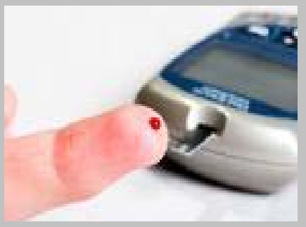
Checking blood levels of Warfarin***