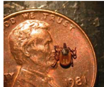
Adult female deer tick on a penny

The bacterium that causes Lyme disease is spread through deer tick bites. The deer tick is very small and many people don't even know that they have been bitten. The tick has to be attached to your skin for up to 36-48 hours in order to give you the bacteria.