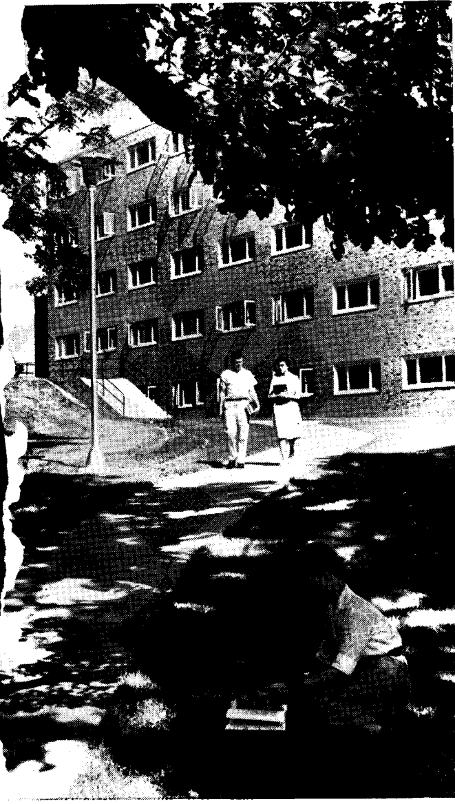
St. Paul Campus Residence Hall—Bailey Hall