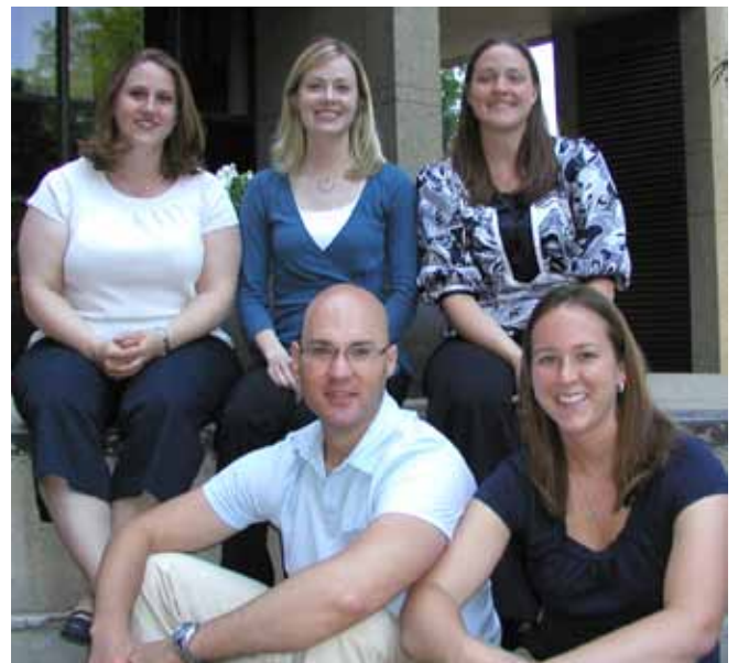
New Mankato residents at June orientation.