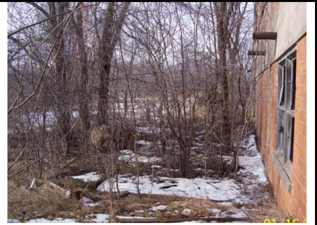
Photo 14. AOC 7A. Possible Transformer storage pad on the south side of Pump House. (2)