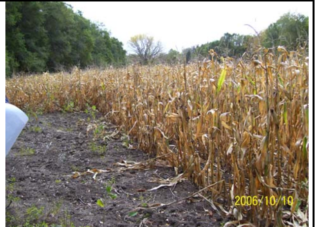
Photo 2. AOC 1. Looking Southeast. Entering Primary Settling Basin from drainage ditch. (1)