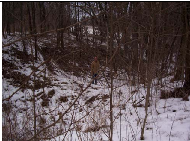
Photo 3. AOC 1. Looking north at remnants of the dam/weir at toe of primary settling basin. (2)