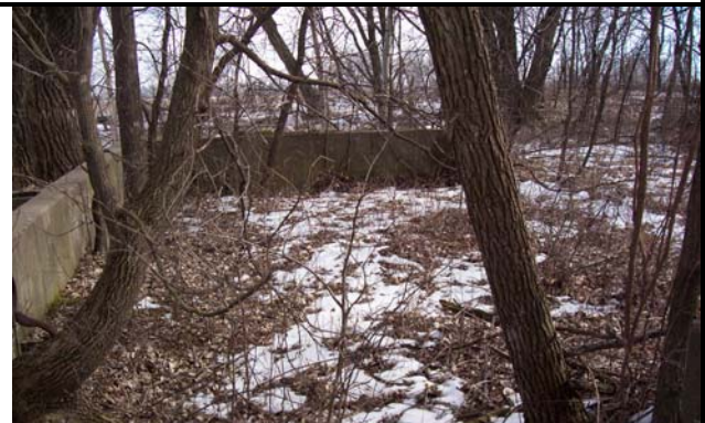
Photo 22. AOC 7D. Looking east at the former Ash Disposal Pit, south and adjacent to the Fuel Oil Tanks located east of Building 401-A. (2)