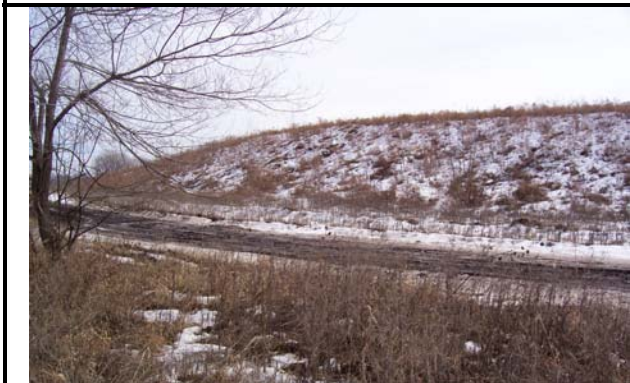
Photo 19. AOC 7D. Looking southeast at stockpiled soil. The toe end of the stockpile on the left side of the photograph is in AOC 7C. (2)