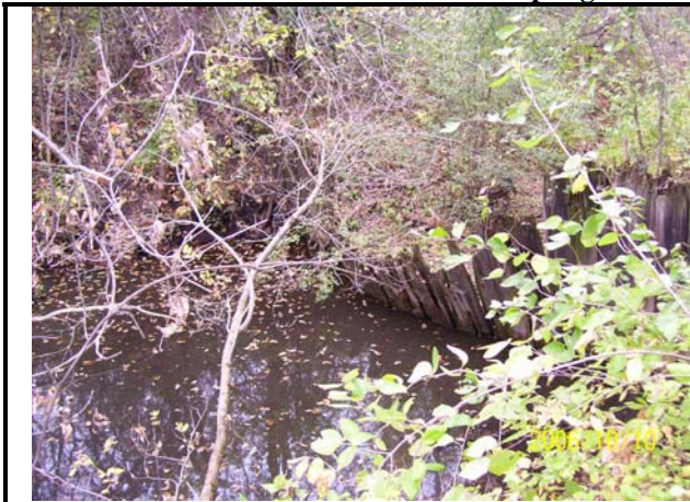
Photo 5. AOC 1. Remnants of gated weir/dam structure at the Southeastern end of the Secondary Settling Basin. (1)