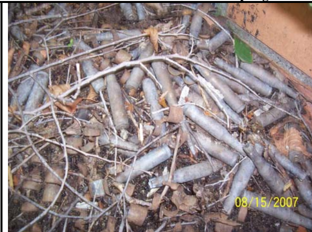
Photo 59. AOC 7A. Discarded small arms practice munitions found next to former transformer pads. (4)