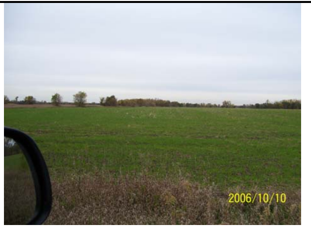
Photo 6. AOC 2. Looking East. Crops: Soybeans, wheat, corn fields and rows of trees. (1)