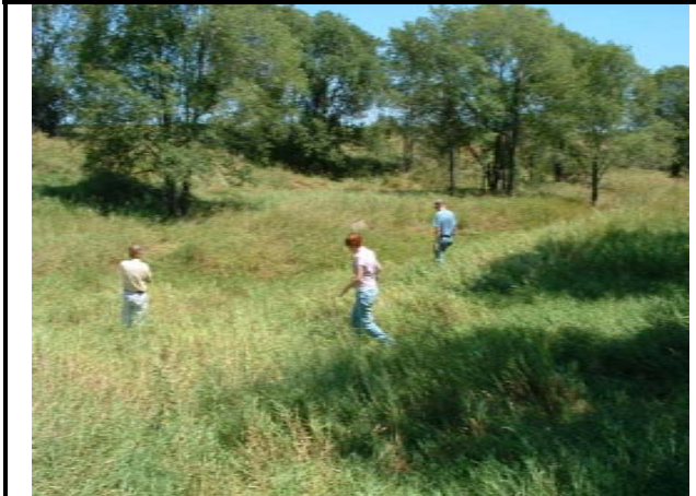
Photo 13. AOC 6. Looking northeast, standing at Bottom of 154 th Street Disturbed Area (3)