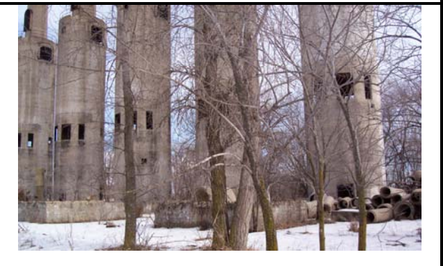
Photo 20. AOC 7D. Looking northeast at the former location of Building 401-A. (2)