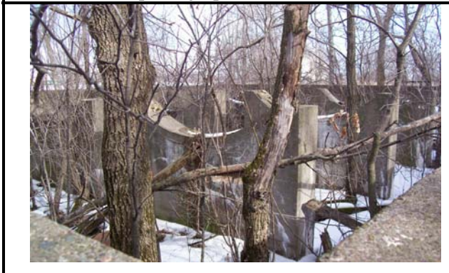
Photo 21. AOC 7D. Looking northeast at the former Fuel Oil Tank location east of Building 401-A. (2)