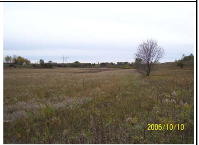
Photo 4. AOC 1. Looking South along the drainage ditch/low area where the drainage enters into the secondary settling basin (darker color vegetation). (1)