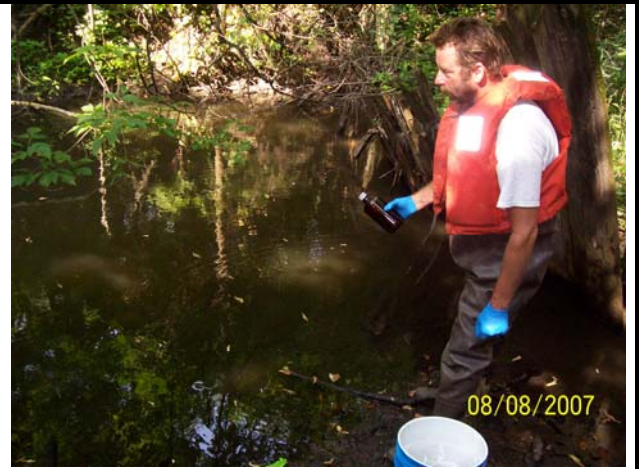
Photo 24. AOC 1S. Upgradient surface water and sediment sampling location. (4)