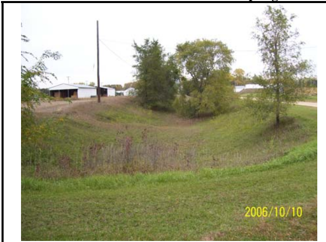
Photo 11. AOC 5. Looking north at a drainage area south of the DNT storage bunkers and north of AOC 3 Drainage Area DA1. (1)