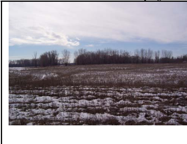
Photo 17. AOC 7C. Looking south at the location of the former Coal Storage Area. (2)