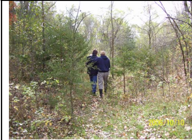
Photo 1. AOC 1. Looking generally south. Walking down drainage ditch towards primary settling basin. (1)