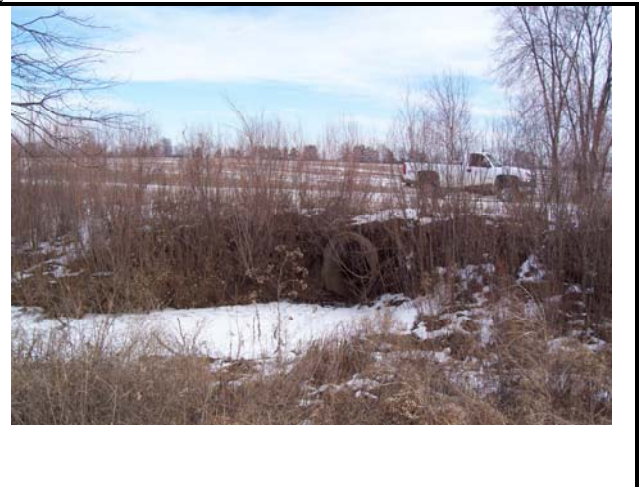
Photo 18. AOC 7C. Looking northeast at a culvert located in the northeast corner of AOC 7C. (2)