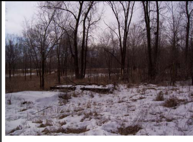
Photo 23. AOC 7D. Two of four of the possible transformer storage pads on the southwest side of Building 401-A. (2)