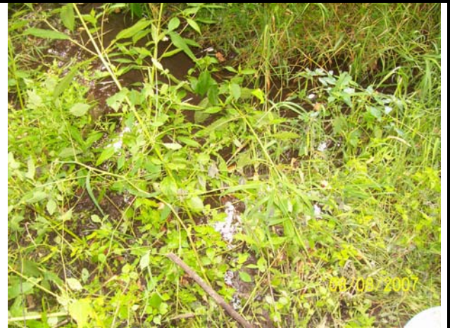
Photo 26. AOC 1S. Downgradient surface water and sediment sampling location. (4)