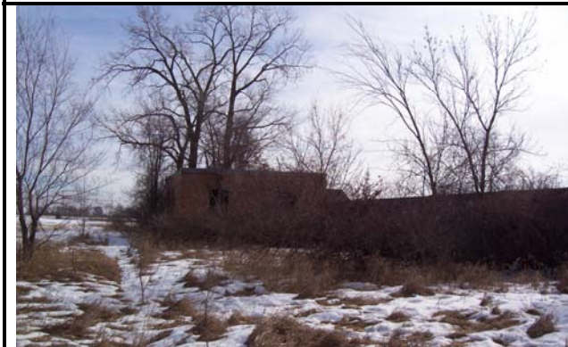
Photo 15. AOC 7A. Looking east. Water Chemical Inlet house attached to the North side of Building 402-A. (2)