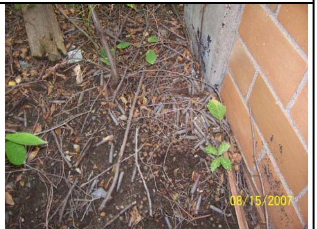
Photo 58. AOC 7A. Discarded small arms practice munitions found next to former transformer pads. (4)