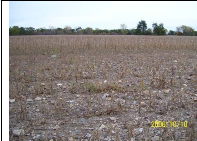
Photo 7. AOC 2. Soybean fields. Foreground possible former building location. (1)