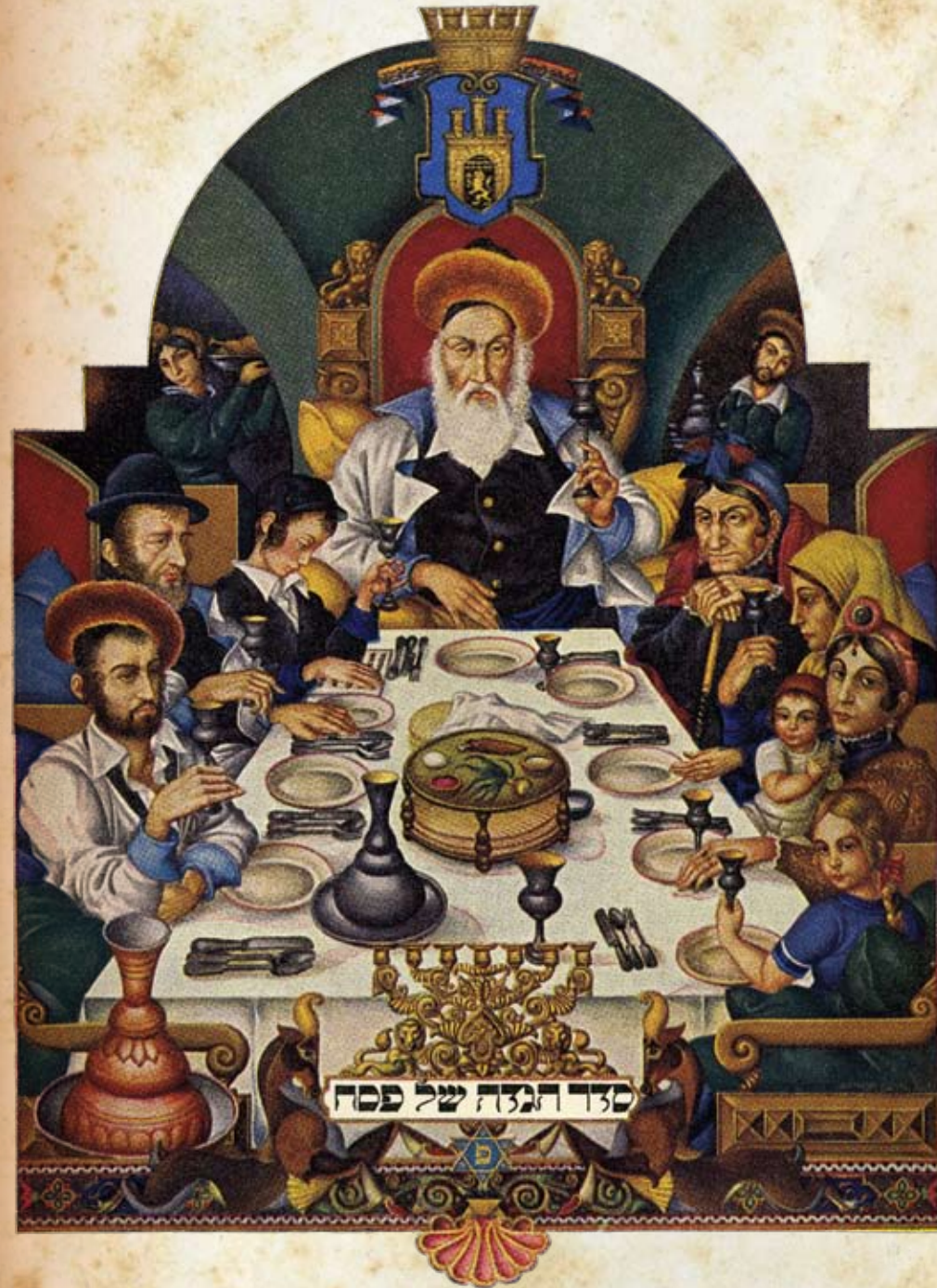
Images from Haggadah Shel Pesach (Passover Haggadah) (Jerusalem: Masadah u-Magen, 1956).