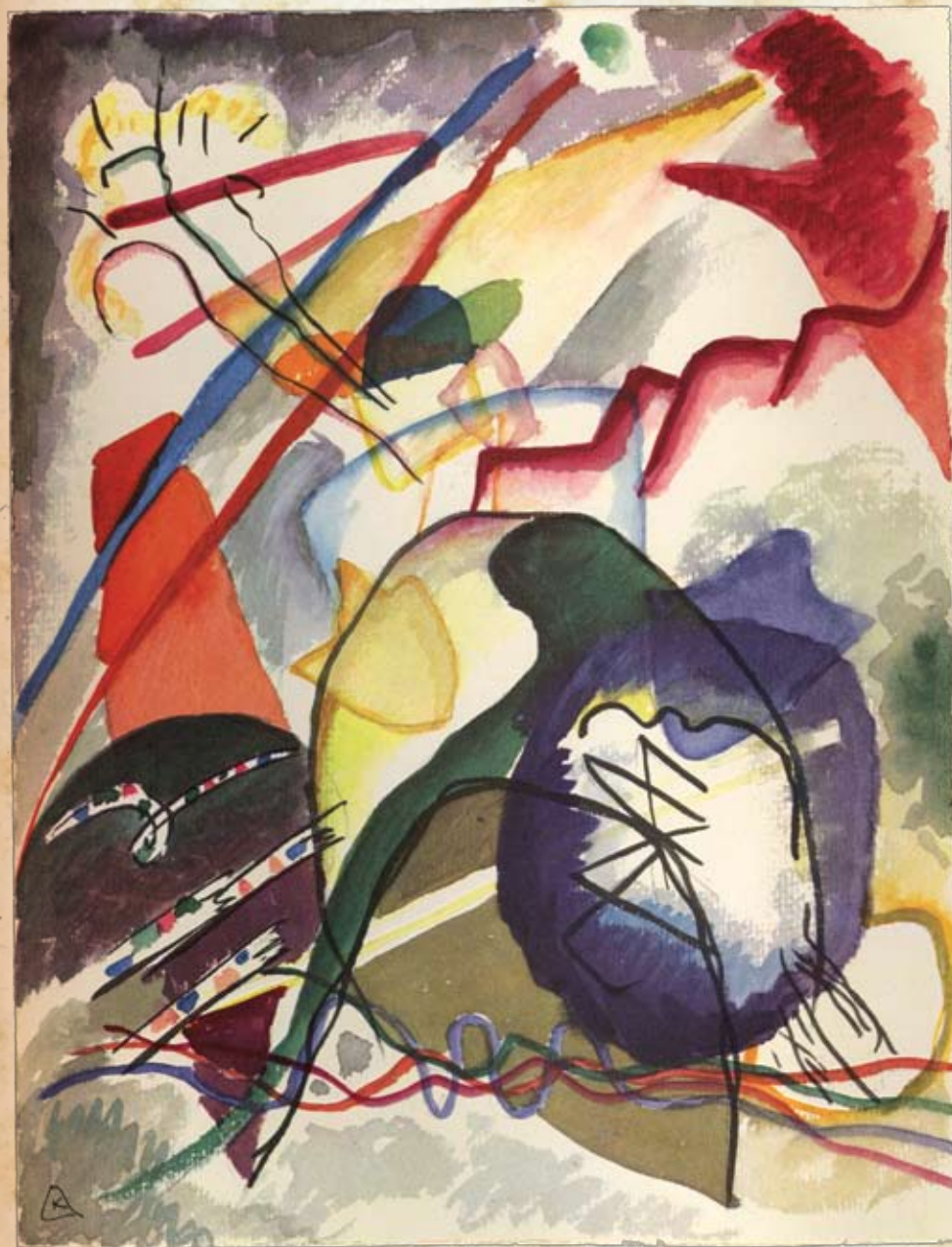
Left: Image from Wassily Kandinsky's The Art of Spiritual Harmony (London: Constable, 1914).