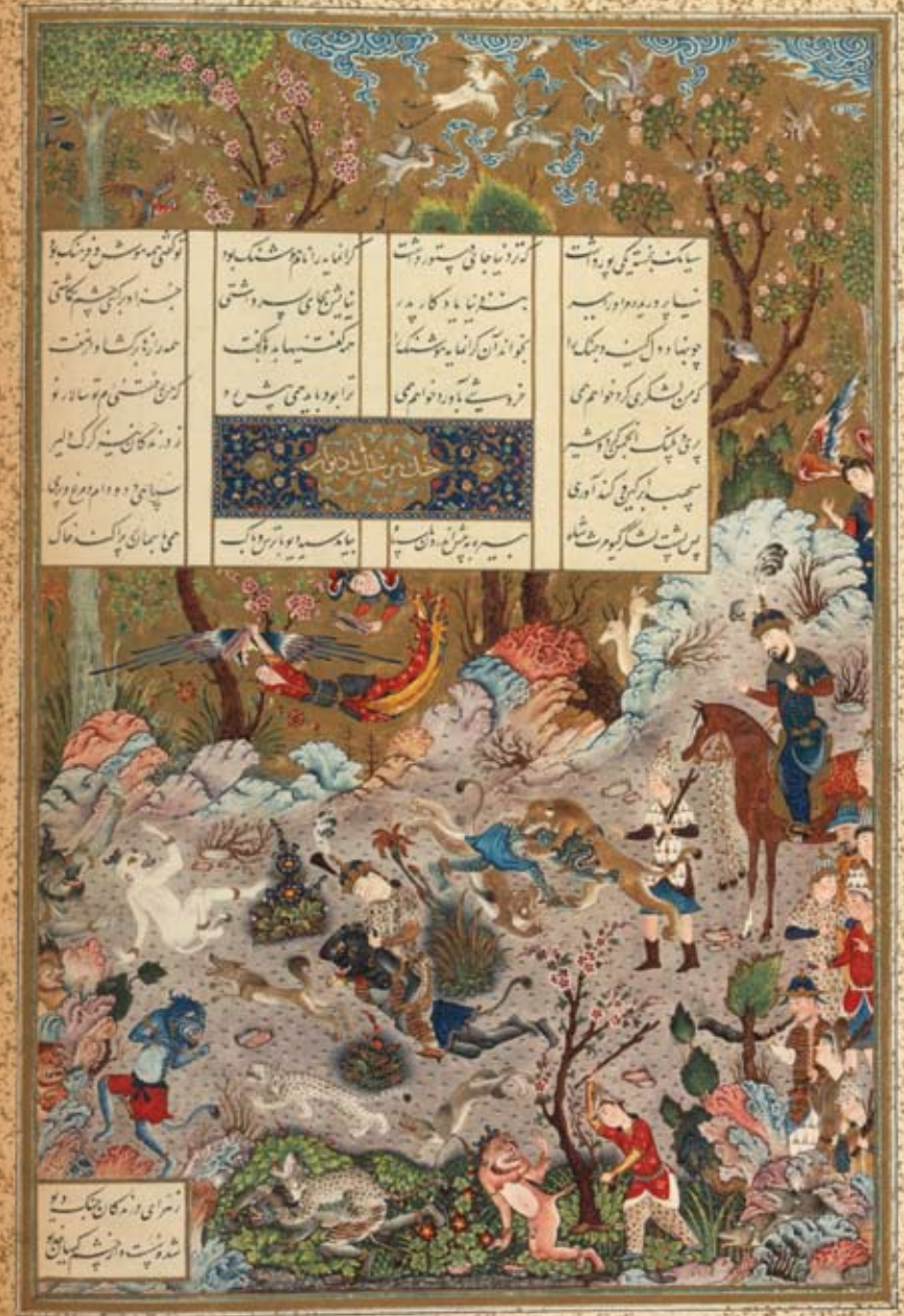
Left: Ferdowsi's Prologue: In Praise of God and the Intellectuals Right: Hushang Slays the Black Div from The Houghton Shahnameh (Cambridge: Harvard University Press, 1981).