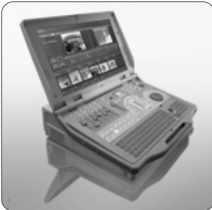
A Sony Anycast Station