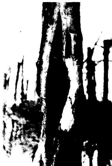
Fig. 2. Past and current bark injuries on one tree.

The present study started with casual field observations of bark injury to sugar maples. As the need for quantitative information became apparent, data were collected on the type, severity, and position of current and past damage observed on 21 one-fifth acre plots in a well stocked red oak-sugar maple forest type.