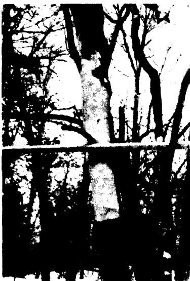
Fig. 1. Four inch sugar maple girdled by gray squirrels.

The gray squirrel is found in Minnesota wherever there are mast bearing hardwoods and is most abundant where there are large blocks of ungrazed, mature hardwood timber. It is active throughout the year, but may hole up for several days during periods of severe winter weather. The presence of gray squirrels in a woodlot is evidenced by the tunnels and holes in the snow made during their search for nuts stored earlier. Gray squirrels sometimes eat the bark of certain hardwood trees during the dormant season. Their bark feeding activity can be separated from that of the porcupine because the tooth marks are smaller, and the discarded outer bark is scattered underneath the tree in small chips.