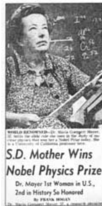
Figure 1. The media has often stereotyped the contributions of women in science. For example, when Maria Goeppert Mayer (a professor at the University of California at San Diego) won the Nobel Prize for Physics in 1963, the headline in a local newspaper emphasized her maternal rather than her professional status.

The compensatory “add ‘at-risk’ students and stir” programs implemented to address earlier wrongs have often failed because they have placed the responsibility for science education reform on those already marginalized by science, especially those at-risk students in developmental education. As a result, most students in developmental education continue to feel implicitly inferior and unwelcome in the neighborhood of science. Perhaps these problems are to be expected; after all, the lack of success in science classes by at-risk students has not been due merely to their absence from science classrooms. On the contrary, it has been largely due to what and how science is taught. Because these aspects of science education have not changed significantly, most of the long-standing obstacles to at-risk students remain.