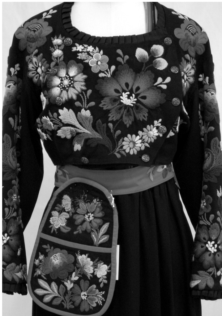
Folk dress ensemble, c. 20 th century, Sweden, embroidery on wool Gift of the International Institute of Minnesota

The exhibition's expansive theme provides special opportunities for collaboration on programs and special events. Please watch the Goldstein website for information on exhibition-related programs.