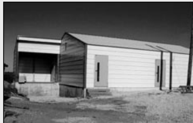
New Century Farm’s new egg processing and storage building under construction.

From the start, Dean’s production model was driven by his goal of developing egg marketing into a year-round enterprise that could provide a full-time family living. Dean felt that a pasture-based production system that kept groups of layers housed in portable buildings regularly rotated among grass paddocks, would not meet his marketing goals. He said the farm is too small for pasture programs that have capacities of 250 to 450 birds per acre. Also, weather conditions in southern Wisconsin normally allow layers to be pastured for little more than six months each year. Dean views pastured poultry as fitting within a diversified marketing program in which eggs are a seasonal product.