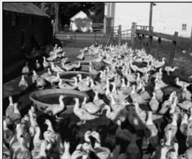
Muscovy ducks in fenced yard with pools.

to a standard old barn with a cement apron outside. Inexpensive plastic swimming pools (one for every 100 ducks) provide the ducks with a place to swim. "When they've been in that barn for two to three weeks, eight to nine weeks of age, we'll take them back to a very large fenced area to roam at will. We don't bother to round them up at night, or pen them up," said Gerald. This fenced area is at least an acre in size and holds about 500 ducks at a time.