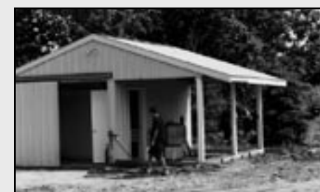
The Joneses' new processing facility.

Currently, birds are killed and bled in four killing cones, then transferred to a scalding tank for 30 seconds in 140-degree water. Scalded birds go into a seven-bird-capacity picker and then onto a stainless steel table for evisceration. The last stop is an ice-water bath for cooling, but Frank and Kay don't like water cooling and plan to change that.