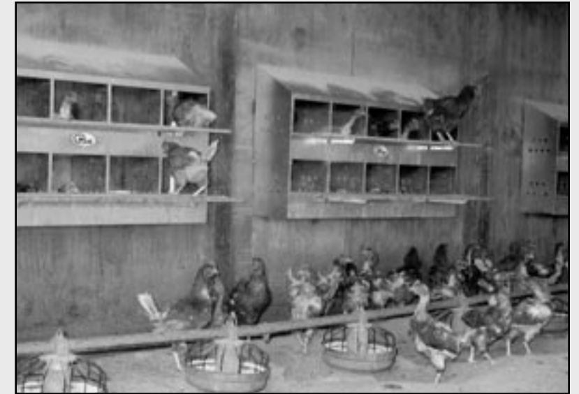
Inexpensive laying facilities include wall-mounted egg boxes and a recycled feeding system housed in an old hog building.