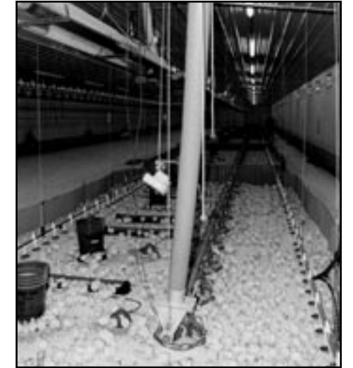
Turkey chicks in brooder house on Bussis Farm.

Turkeys are almost always sexed. Males and females are brooded separately and grown-out separately. This method is more practical with the longer grow-out period. To minimize health risks, brooders are reared and housed separately from the more mature grow-out birds (young birds are susceptible to pathogens carried by older birds). Housing construction is similar for both brooding and grow-out. Industrial houses or barns are usually built new on hard ground or cement pads, insulated, and equipped with automated feeding, lighting, and ventilation systems.