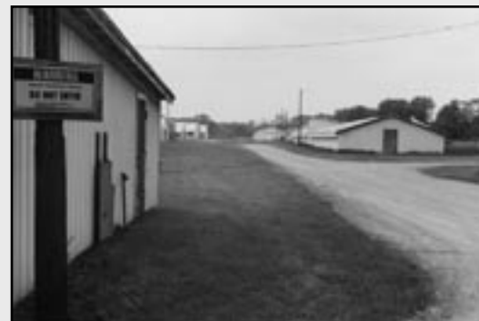
Biosecurity: a warning sign at the entrance reminds visitors of the need for disease control.

The plant was set up to process 4.25 million turkeys a year, producing boned turkey meat valued at about $72 million. Plans included adding further-processed, value-added cooked products under the name “Golden Legacy,” at some point in the future. Those original goals have been met or exceeded, Lennon said. Despite some bad years for turkey since 2000, the plant has sold at least $72 million worth of products each year. Running one full shift a day, it processes 4.5 million birds a year. It has captured contracts with the state of Michigan’s Department of Corrections to provide cooked and raw turkey to state prisons. It has contracted with other companies to prepare cooked turkey products valued at about $10 million a year. It has added one grower member to the original 15, and several growers have expanded production.