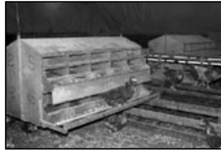
Nesting boxes in Schlangen retrofitted barn.

Old barns and outbuildings may be retrofitted by adding utilities, feeding stations, nesting boxes, roosts, vents, lights, and heat. Minnesota grower Alvin Schlangen, for instance, converted his ten-year-old 48 ft by 368 ft high-rise style barn (originally built to contain 80,000 caged layers under contract with an integrator) to a multilevel house for 6,000 layers. He lined the walls with a poly-type plastic to improve insulating capacity. He also covered the plywood floor beneath feeding stations with plastic to protect against rot. Alvin cut several side openings in the barn to give birds yard access between May and October. The barn is also equipped with two 24-inch exhaust fans, a 500,000 btu corn-burning furnace, and overhead fluorescent lighting. Alvin added standard galvanized nesting boxes (ten spaces per box), floor pan-feeders, and a nipple watering system. He uses natural convection cooling in summer months to reduce energy demand.