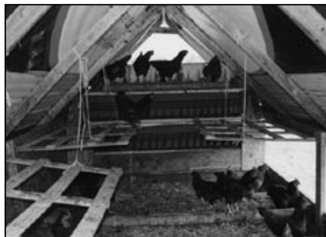
Machine-portable layer house with roosting bar.

Layer house. Either of the broiler housing options described above can be used for layers in the day-range system. However, you will need to reduce your stocking density, build-in nesting boxes, and add roosting bars for hens and turkeys. Lee and Foreman recommend roosting space of 7 linear inches per hen and overall floor space of 1 to 1.25 square feet per bird during summer (more space is required for the larger dual-purpose breeds). Plamondon recommends 2 square feet per hen. As the weather turns cold and your birds spend more time inside, you will need to give them a little more space. When there is enough insulation and ventilation to eliminate condensation, approximately 2.3 square feet per hen is recommended. If you are not controlling ventilation, then 4 to 5 square feet is advised (Plamondon, 2003).