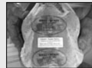
Organic certified chicken packaged for market.