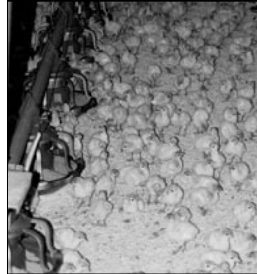
Turkey chicks in brooder house.