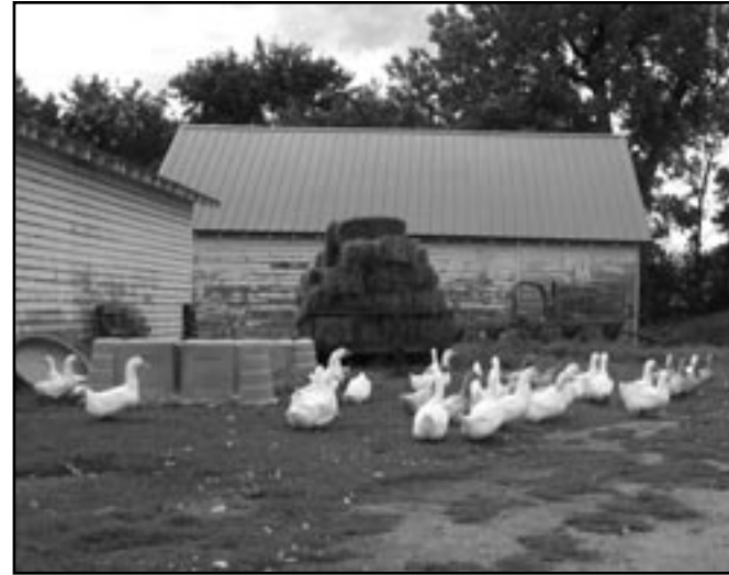
Geese foraging in barnyard.

Waterfowl, particularly geese, will eat anything from shattered grain (leftover in fields after harvest) to grasses, clovers, insects, and worms (Mercia, 2001). Weeder geese like the White Chinese and African are often turned out in orchards and newly planted fields to control insects and to weed. “These geese can eat grass and young weeds as quickly as they appear, but do not touch certain cultivated plants,” note University of Missouri-Columbia animal science specialists Glen Geiger and Harold Biellier (Geiger and Biellier, 1993b). Geese also consume weed seeds, slugs, snails, and other insects, (Holderread, 2001).