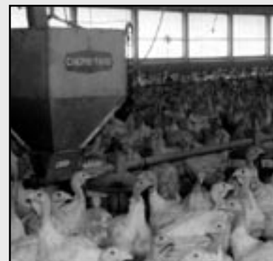
These turkeys are close to market weight of 40 pounds.