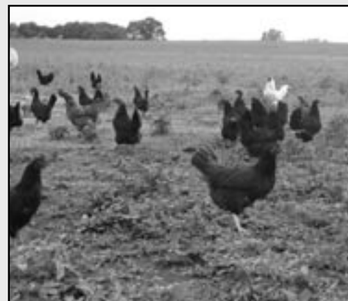
Layers on pasture on the Desenes farm.

His ruminants are fed grass only, and the poultry get as much grass as possible. "The laying hens we want to have out on pasture as much as possible. We're building shelters that are sufficient for them to stay out there all winter."