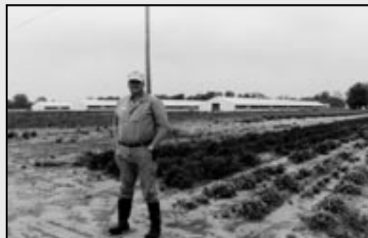
Layout of the building complex. Open land is rented out to a grower of plant nursery stock.

The plant originally hired 215 line employees and 55 in sales and management—many of them experienced Bil-Mar workers. It now has 400 employees. The facility cost more than $20 million to build. Funding came from CoBank, part of the Farm Credit System, on condition that the co-op members raise half the money. The 15 grower members contributed most of it, but some came from outside investors. Several of the grower loans were guaranteed by the USDA’s Rural Development Agency.