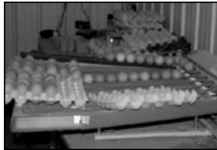
Processing and sorting for sale on Schlangen's farm.

Candling. Candling, the use of a light to see through egg shells, is a well-known method for checking interior egg quality and fertility. Farmers use candling equipment to check eggs for cracks, blood spots, embryo development, and air cell size (air cell size measures freshness). Brown eggs are considerably more difficult to candle because blood spots tend to blend in and air cells are harder to detect. Candling is not necessary when selling eggs on the farm, or in some states, such as Wisconsin, when selling to your customers at farmers' markets. Be aware, however, that brown eggs have a higher tendency for blood spots and a single "bad" egg can turn off customers. For this reason, candling, even though not required, may be a good idea.