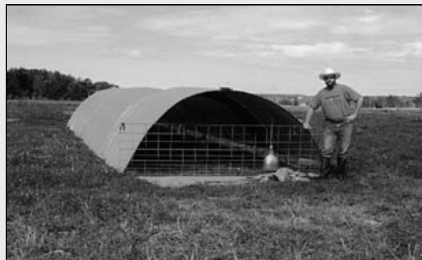
The Hansens' pasture shelter consists of wire cattle panels covered with a tarp. It is designed to be moved to new pasture weekly, rather than daily.

After some trial and error, he settled on pasture cages made of cattle and hog panels. Two 16-ft wire cattle panels are bowed over a pair of 2 ft by 4 ft frames spaced 12 feet apart. Hog panels are placed on the other two sides, with chicken wire preventing birds from escaping through gaps in the panel wires. About half of the side and roof area is covered with a tarp. Positioning the pens so that the tarp is to the windward side has prevented the hoop houses from being turned over in even the highest winds, Mike said. The structure, which weighs about 125 pounds and requires less than $100 in materials, can be moved by hand with a dolly.