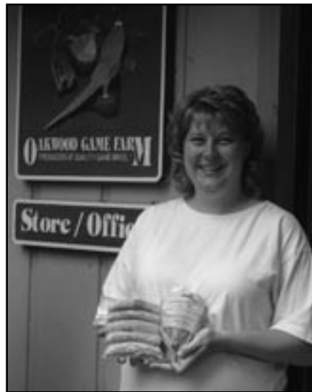
Oakwood Game Farm in Princeton, MN.

Captive Game and Other Specialty Birds. The University of Minnesota Extension Service defines game birds as all fowl for which there is an established hunting season (Noll, 1998). Technically, they are not part of the poultry family, but a growing number of poultry producers are looking at captive game birds as an alternative niche marketing opportunity that offers lucrative supplemental income. Pheasant and quail, for instance, can sell for three to four times the price of chicken in some markets (DiGiacomo, et al., 2004).