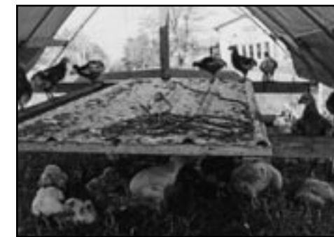
Machine-portable broiler house.

Housing. Regardless of whether you raise chicken broilers or laying hens, turkeys, or ducks, day-range housing needs to be portable, weathertight, and predator proof. All shelter designs have doors or access holes to a fenced pasture area. Pastures are enclosed with electric, predator-proof perimeter fencing and divided into paddocks using one-inch poultry netting. When it comes to the perimeter fencing, livestock specialist David Pratt said “More elaborate designs are often needed for predator control. A high-tensile fence design that has effectively prevented dog and coyote predation consists of nine wires mounted at heights of 5, 11, 17, 23, 30, 37, 44, 52, and 60 inches. Every other wire is electrified (including both top and bottom wires). Wood posts are spaced 75 to 100 feet apart with fiberglass stays installed at 20-foot intervals.” Contact the Center for Integrated Agricultural Systems (see Resources under Agencies and Organizations ) for more information about pasture fencing and installation.