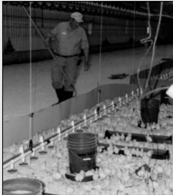
Two-day old turkey poults in brooder house, 720 poults within each ring.