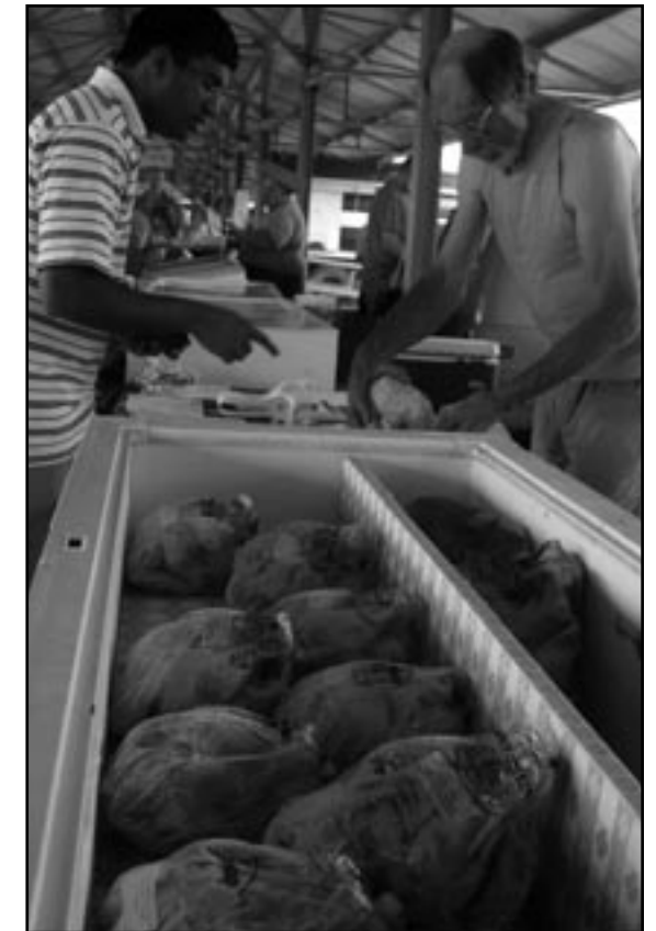
Frozen chickens for sale at Minneapolis Farmers' Market.

Licensing. Farmers who sell eggs from their farm are exempted from obtaining a food handler's license. In most states, a handler's license will be required when selling eggs through an intermediary (retailer, wholesaler, restaurant) or even at a farmers' market. Retail buyers, in particular, are obliged to purchase products only from “approved” sources (in other words, from licensed handlers). Food handler's licenses are renewable annually. Applications can be obtained by contacting your state department of agriculture (see Figure 13).