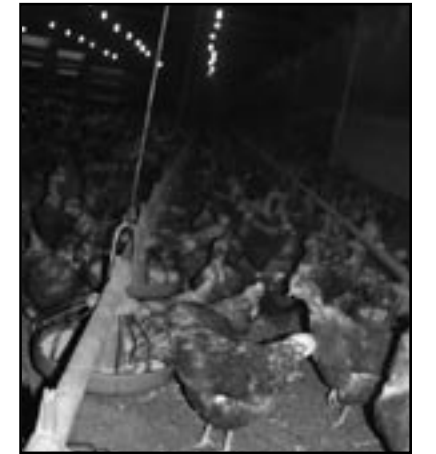
Layers at feeders.