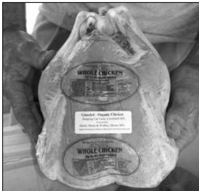
Desenses' organic chickens for sale at the Minneapolis Farmers' Market.

Packaging regulations for poultry and other meat products were established to maintain freshness, quality, and food safety. Packaging chemicals and colorants can migrate to food and for this reason are considered an indirect additive. All additives must be approved by the U.S. Food and Drug Administration (FDA). Poultry and other meat processors are required to use FDA-approved packaging materials and maintain on file a “statement of assurance” or guarantee from the packaging supplier to verify that packaging meets codes under the Federal Food, Drug and Cosmetic Act (USDA, Food Safety and Inspection Service [FSIS], 2000).