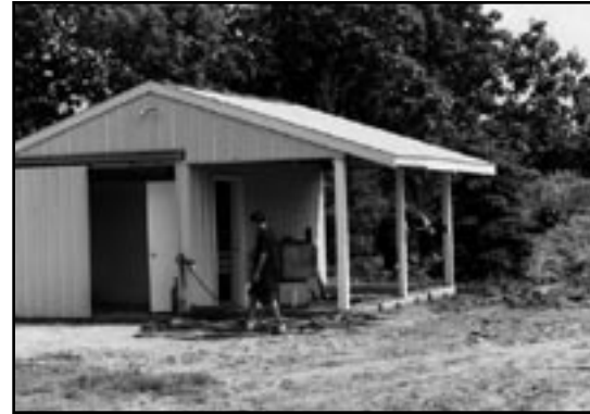
New on-farm processing building on Jones farm (see Farm Profile: Management Alternatives–Day-range).

On-Farm Processing. On-farm processing is a somewhat unique opportunity for poultry producers. Birds are relatively easy to handle (even turkeys) when compared to other livestock. Most on-farm processing is done manually. Processing volume — more than anything else — will affect labor requirements, equipment choice, facility design, and legal obligations. Two on-farm processing alternatives, manual and mobile, are well-suited for growers interested in butchering 20,000 birds or less each year and are reviewed briefly below. Use this information to begin narrowing your focus, then see Resources under Processing for more information about the alternative that seems most suitable for your operation.