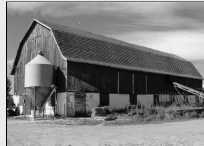
An old dairy barn is home to chicks for the first four weeks until they are ready to go out on pasture.