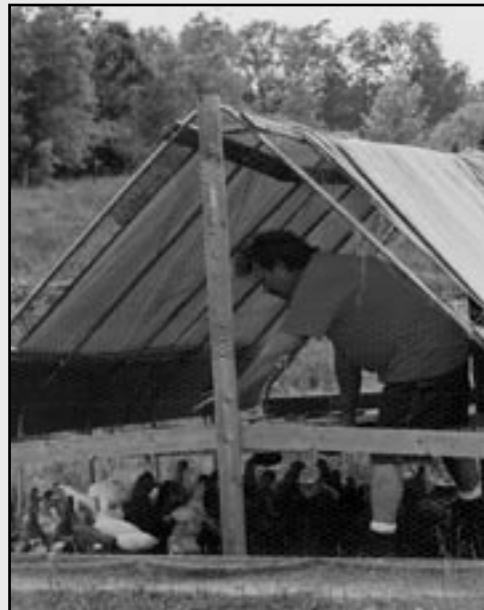
Frank Jones checking on birds in machine-portable broiler house.

On any given day, the Joneses have 500 to 600 chickens—250 of them laying hens, two batches of 100 growing broilers, and another 100 broiler chicks in the brooder house. In late summer, there are also 60 turkeys growing toward Thanksgiving. Each group needs daily care.