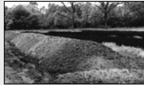
Turkey manure composting. Joel Bussis markets the compost to local farmers.

The compost is short one element—water. “The manure cake is quite dry, 17 to 22 percent moisture, and the brooder manure is drier still,” Joel said. “You need 40 to 50 percent moisture to get a good heat going.” He piles the manure into windrows and waits for rainfall to raise the moisture level. A 1,500-gallon water wagon can be used to add water if needed. Composting is a key part of the operation, for without a good waste disposal system the operation is not viable.