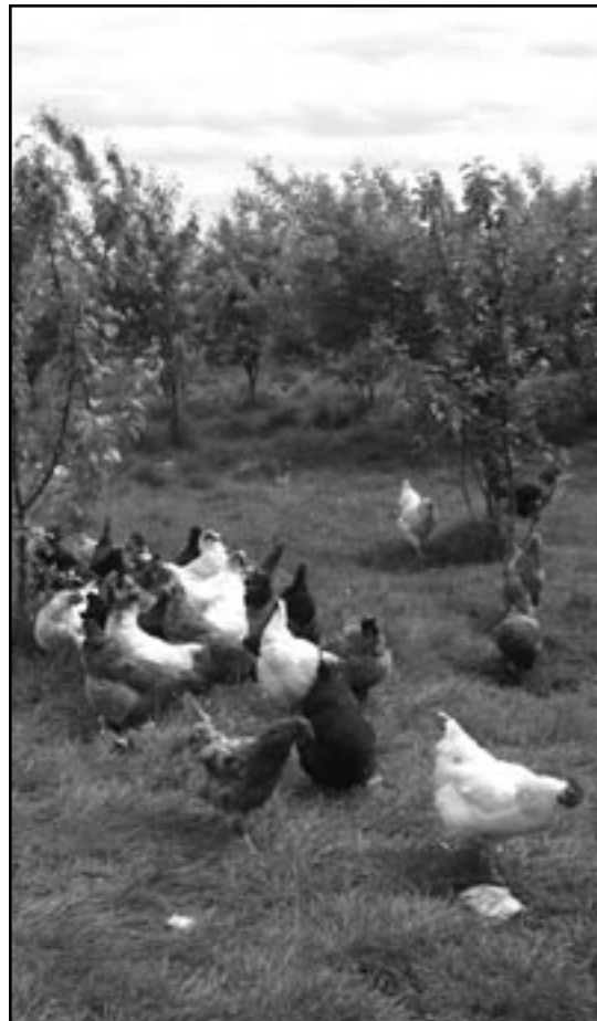
Day-range chickens on pasture.

Poultry Marketing Alternatives begins with basic background information about poultry meat and egg markets—customers, products, and relative prices (when available). In Poultry Processing Alternatives we discuss on-farm and off-farm processing options, as well as the legal considerations associated with each. In the next chapter, Poultry Management Alternatives , five poultry production systems are described: (1) Industrial Management; (2) Traditional Management; (3) Day-range Management; (4) Daily Move Pen Management; and (5) Organic Management. Accompanying each management description are real-life profiles of successful poultry farmers in Michigan, Minnesota, and Wisconsin. In the profiles, growers talk about how a particular management system is working on their farm, what types of challenges they've experienced, where they market, how they get their poultry products to market, and what they might do differently next time.