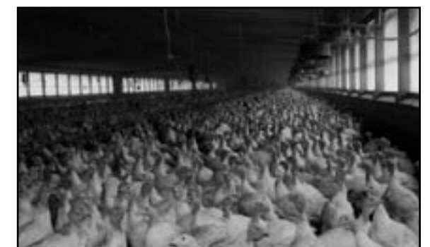
Nearly fully grown turkeys on the Bussis farm. At this stage, Joel can move slowly among the birds to monitor their condition.

Clean-out. Once your birds are headed to the grow-out house or processor, clean-out must begin. Growers are responsible for cleaning out, washing, and disinfecting barns as well as disposing of manure and litter after each batch of birds has been removed. Manure and litter packs are often removed with a skid steer loader or other equipment and hauled off-site for biosecurity reasons. Broilers deposit four pounds of litter per bird over an eight-week period (Mercia, 2001).