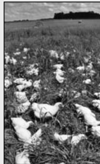
Cornish Cross broilers on pasture.

Although they began with mostly laying hens, for the past few years, they have slowly been building up broiler production. The Desenses use a standard breed of broiler, the Cornish Cross, but Arthur feels their broilers are "somewhat unique in that we don't butcher until 13 weeks of age. The result is chicken that is leaner with more texture. It's a roaster, not a fryer." One might assume these chickens would be huge after this much time, but "they're only about three to five pounds. If you give them more room and restrict their feed, they will grow slower and remain much more active," Arthur said. The Desenses have had good results from this method of raising chickens. Arthur states, "No leg problems and no instant heart attacks. If you give this breed unlimited access to feed, they'll eat continuously, become lethargic, and some percentage of them will drop over dead."