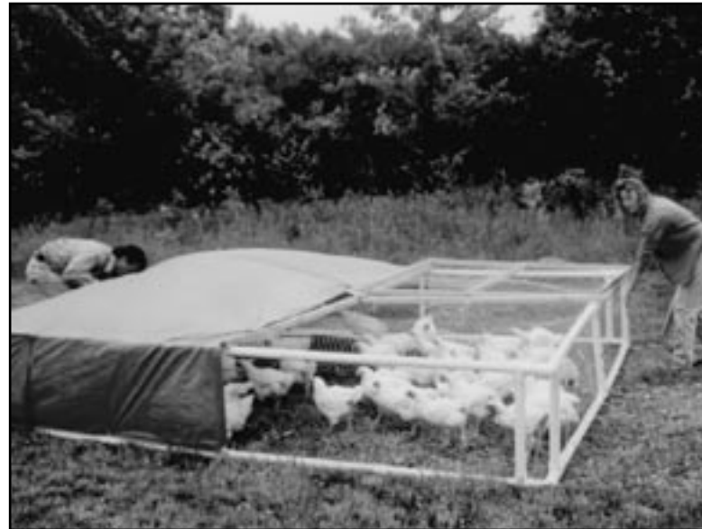
This daily pen was used by Frank and Kay Jones when they first started pasturing poultry. Pens were moved several times a day.

The flat roof design makes the pen wind-resistant (that is, it is less likely to blow away) and the removable panels or hatches provide easy access to the birds when adding feed and water. The 2 ft wall height is low enough to step over, but tall enough to prevent broilers from flying out. If you plan to raise anything other than the Cornish Cross broilers (such as traditional breeds, turkeys, and waterfowl) you may have to modify the design to prevent the birds from escaping (Plamondon, 2003). For detailed design and construction instructions, see Joel Salatin's Pastured Poultry Profits .