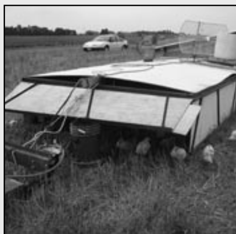
Layer shelter on skids that gets moved every three to five days.

About 30 to 40 percent of the chickens' diet comes from grass. By moving the pens at least 50 feet every day, the chickens get new pasture. Ron adds, "They eat grass. They eat the leaves right off of the alfalfa plant." Arthur adds, "The Cornish Cross chicken isn't as good at foraging for its own food as the standard laying breeds."