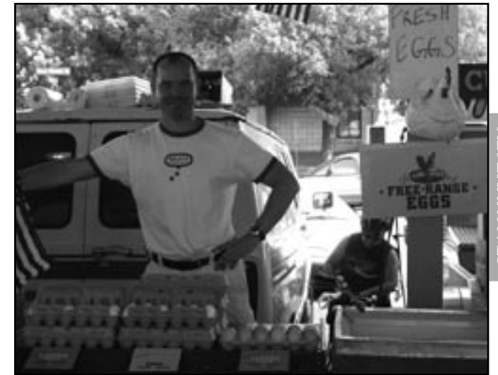
Pease eggs at Minneapolis Farmers’ Market.

Table eggs. Farm-fresh eggs are usually one of the first things to sell out at farmers’ markets. On average, every American consumes 250 eggs annually (USDA, Economic Research Service, 2004). That’s a lot of eggs! If you’re thinking about tapping into this market be sure to explore customer preferences for egg variety (chicken, goose, duck), color (white, brown, blue), nutritional content (Omega-3, cholesterol—see Figure 10), size (small, medium, large, extra-large, jumbo) and packaging (bulk, half dozens, recycled packaging). All retail eggs come sized and graded by freshness, interior egg quality, and shell appearance.