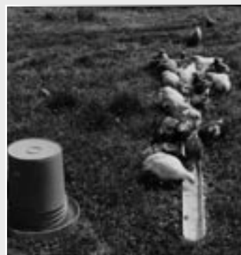
Feed and waterer in pasture.

Frank and Kay buy organic grains that Frank grinds in batches of 1,000 pounds with a portable feed grinder powered by tractor power take-off. Chicks need higher protein and a finer grind. Grains include oats, corn, wheat, soybeans, and field peas. The Joneses use Fertrell minerals and supplements that include oyster shells, which can enhance egg shell quality.