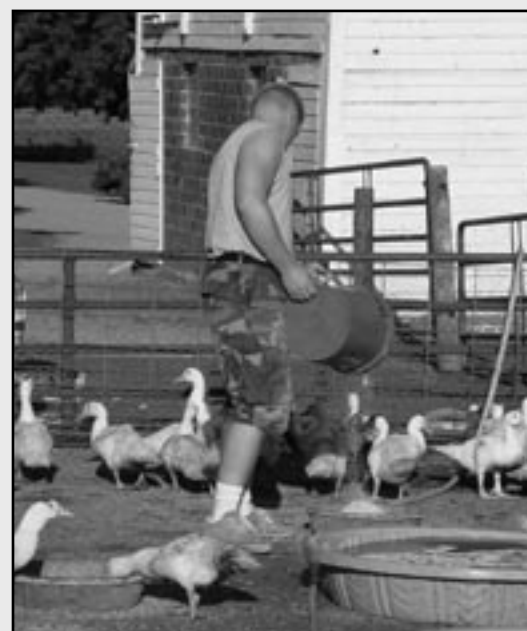
Mash time for Muscovy ducks.