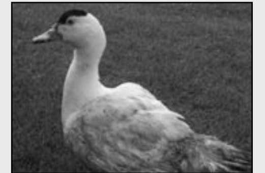
Muscovy duck in Dammann barnyard.