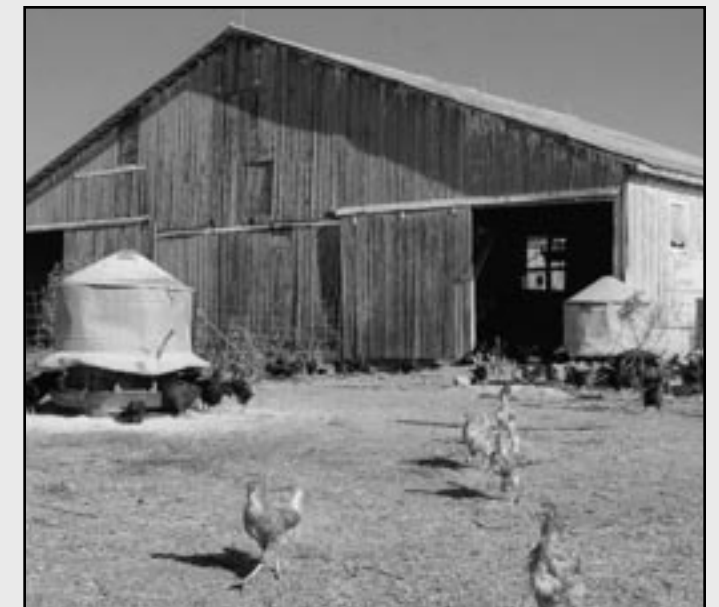
Layers have access to an outdoor run for about half the year.