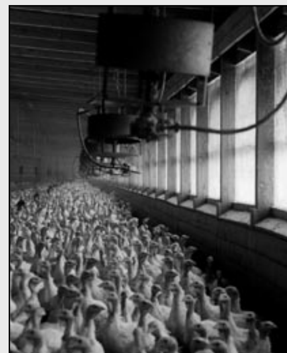
Feeding system, waterers, heaters, fans for ventilation and side curtains in a grow-out building.

Mortality is a fact of life with poultry, Bussis said. What has to be prevented is catastrophic loss. The farm has “stand-by generators in case of electrical failure.” “When I was young and we were producing eggs, we lost 40,000 pullets in cages in a power failure,” Joel said. In heated, ventilated brooder barns, heat and ventilation systems have to work.