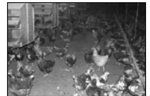
Layers in traditional housing.

If you are a prospective poultry grower, you will need to become familiar with a few management basics before studying the details of a particular management system. These basics include poultry housing, equipment, supplies, flock management, and labor. Under flock management we address poultry feed, water, and health at different stages of production (brooding, laying, grow-out). Many commercial growers purchase day-old chicks or immature birds (such as pullets) from hatcheries when new birds are needed. If you are interested in raising your own replacement birds or managing breeding stock, see Resources under Species/Class/Breed Information for a list of recommended publications.