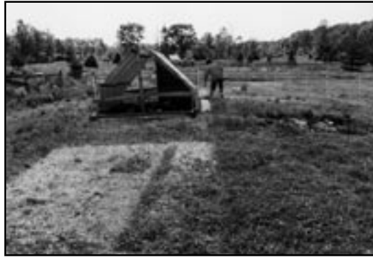
Frank Jones puts out supplemental feed. Portable houses are moved frequently to provide fresh pasture, and limit manure build up.

Domesticated waterfowl, such as “weeder” geese, tend to do well on grass and, because they are easily corralled into shelters, require less labor than most pastured poultry (Manitoba Agriculture and Food, 2002). At about five to six weeks of age, goslings can “subsist entirely on good pasture” (Geiger and Biellier, 1993). Just about any waterfowl breed will perform well since grass is its natural food. Some waterfowl growers recommend choosing breeds that have light-colored skin and feathers because they do not absorb and retain as much heat.