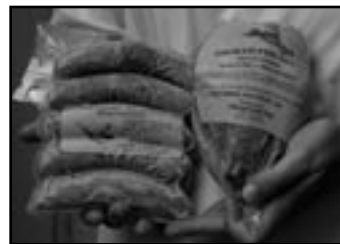
Wild game products.

Other specialty birds, particularly within Asian markets, include squab (young pigeon) and black skinned chicken (see chapter on Poultry Marketing Alternatives for more information).