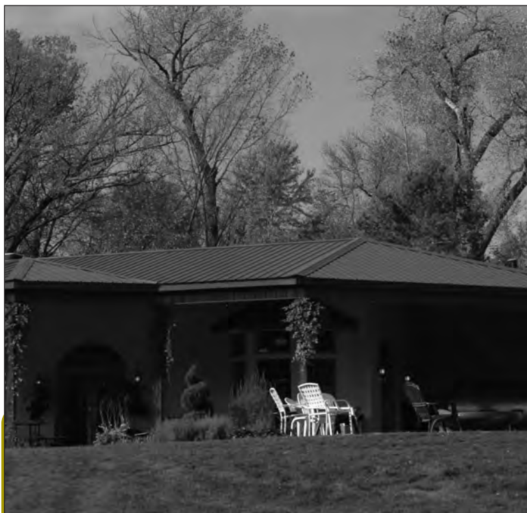
MORGAN CREEK VINEYARD

For more information on Minnesota wineries and grape growing, visit the Minnesota Grape Growers Association site at www.MNgrapes.org and the U of MN cold hardy grapes site at www.grapes.umn.edu .