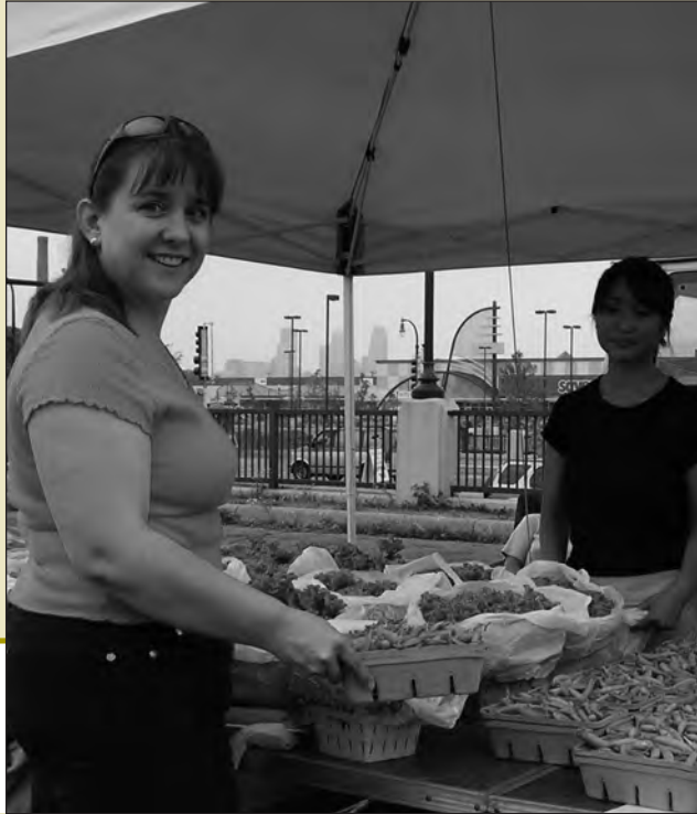
MIDTOWN FARMERS' MARKET

The Midtown Farmers' Market, a bustling and successful relatively new market