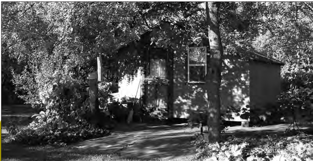
THE BROODIO AT MOONSTONE FARM

Media attention, logos, and fancy brochures won’t insure a successful enterprise if you don’t provide a quality product and outstanding service. At a minimum, you must have clean and safe areas and equipment, anticipate customer needs, and provide knowledgeable, friendly customer service. To distinguish your operation, consider little “extras.”