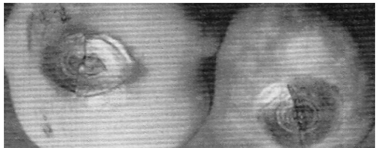
Figure 4. Tomatoes showing symptoms of soil rot.

Fruits in contact with soil may be attacked by the soil-borne fungus Rhizoctonia solani , which causes soil rot (see figure 4). Supporting plants to keep fruit off the ground almost eliminates this disease.