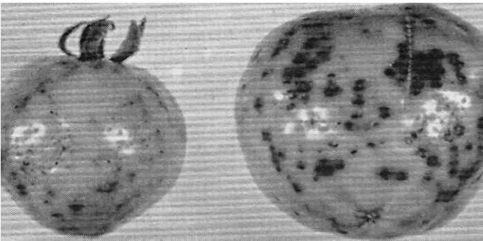
Figure 3. Tomatoes showing symptoms of bacterial speck.

Read the pesticide label and follow the instructions as a final authority on pesticide use.