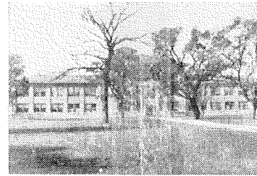
Institute of Public Health & Pathology. (Pathology and Bacteriology.) Students will register in this building.