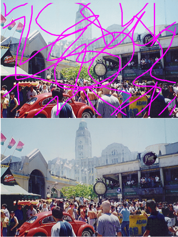
Figure 1: (top) Color photograph with lines obscuring parts of the image, (bottom) Navier-Stokes inpainting restoration of the photograph.

The topology of the inpainting region does not pose a problem, unlike the approach in [25, 26].