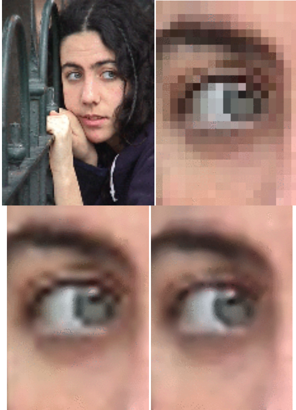
Figure 3: Top left: Original image of girl, 120X160 pixels. Top right: one of her eyes (19x27 pixels) magnified with zeroth order zoom to 169x241 pixels, Bottom left: bicubic interpolation, Bottom right: Navier-Stokes inpainting. Note how the edges are smoother with the NS approach, e.g., the eye ball.

vision research. Second, the very close connection to CFD has the potential to draw more people from that community to explore problems in image processing and computer vision. This can only serve to accelerate the development of the field.