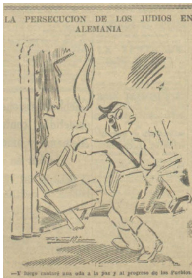
Spanish Editorial Cartoon. "The Persecution of the Jews of Germany"

"and then I will sing an ode to peace and the progress of the people."