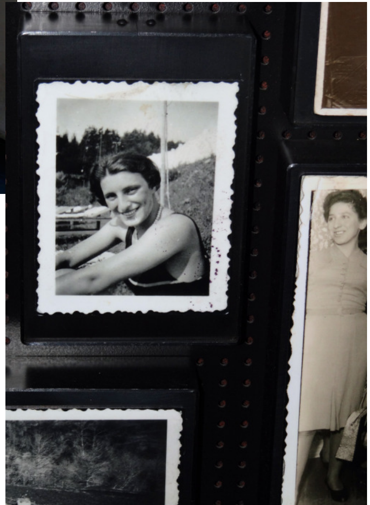
Exhibit of photos found, left by those who were murdered at Auschwitz-Birkenau.

CLA External Relations at hicks002@umn.edu or by phone: 612-625-5541. You may also donate on line at http://www.chgs.umn.edu/giving/index.html .