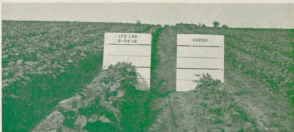
Fig. 1. Effect of starter fertilizer (as listed on the board at left) on soybean growth at Rosemount, 1955. Soybean rows at the right were not fertilized.

The differences in the soybean growth between the fertilized and the unfertilized soybeans was evident during the entire growing season (figure 1). The eventual unfertilized soybean yield was 22 bushels per acre, whereas the fertilized yield was 26 bushels. Since only a complete fertilizer was used, it is