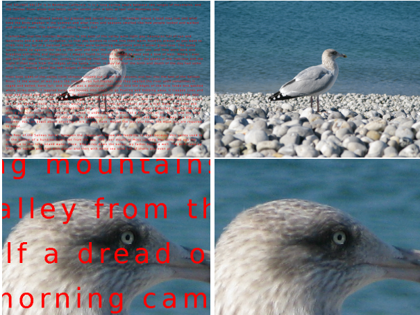
Figure 2. Inpainting example on a 12-Megapixel image. Top: Damaged and restored images. Bottom: Zooming on the damaged and restored images. (Best seen in color)