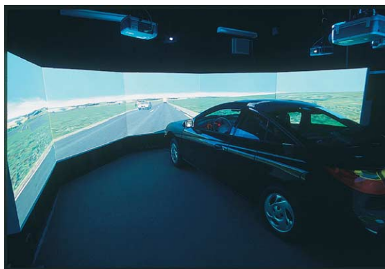
Fig. 3. Virtual driving simulator.