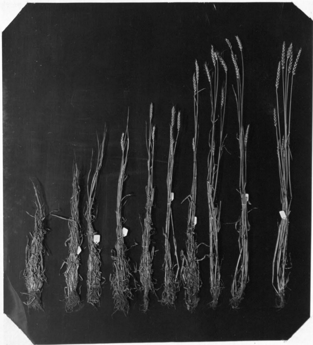
Plate 2. Showing the segregation for time of heading in the Marquis x Kanred F_3 plants representing F_2 Classes, spring sown. Left - P 1068 (Kanred) Center - F_3 Hybrids Right - Marquis.