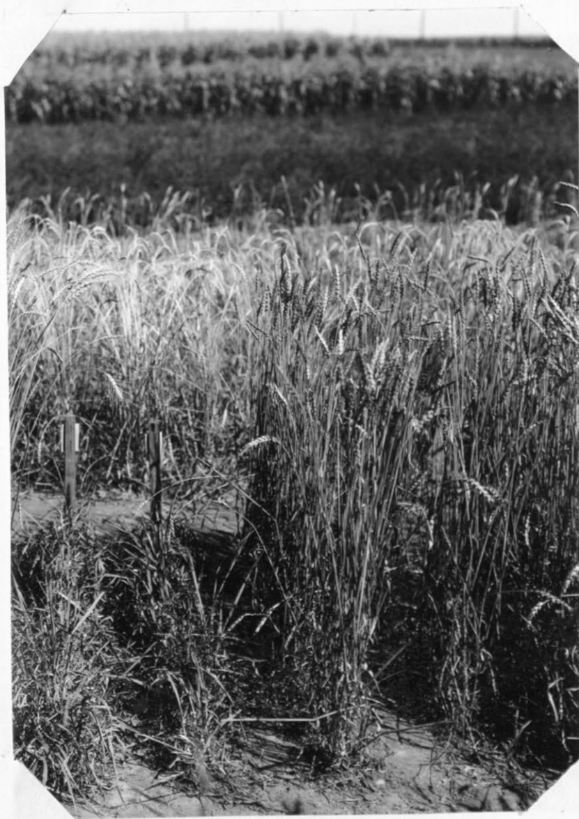
Plate 1. Showing the difference in growth habit when spring sown between Kanred winter wheat (left) and Marquis spring wheat (right) at harvest time.