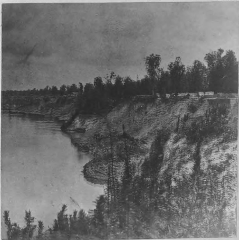
"View of Bluffs at Port Hudson, fronting on the river taken from the citadel of rebel fortifications."