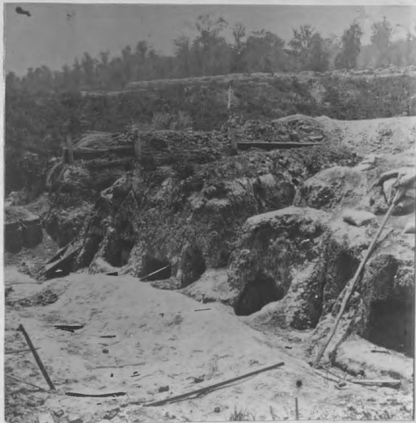
"View of 19 Gun battery(ours)taken from the citadel (Reb) showing the ditch and holes used by the Confederates at the citadel. Port Hudson, La."