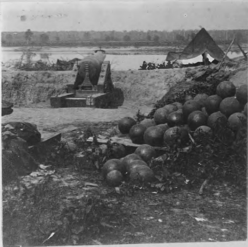
"View of the rebel gun Alabama and battery fronting on the river. Port Hudson, La."