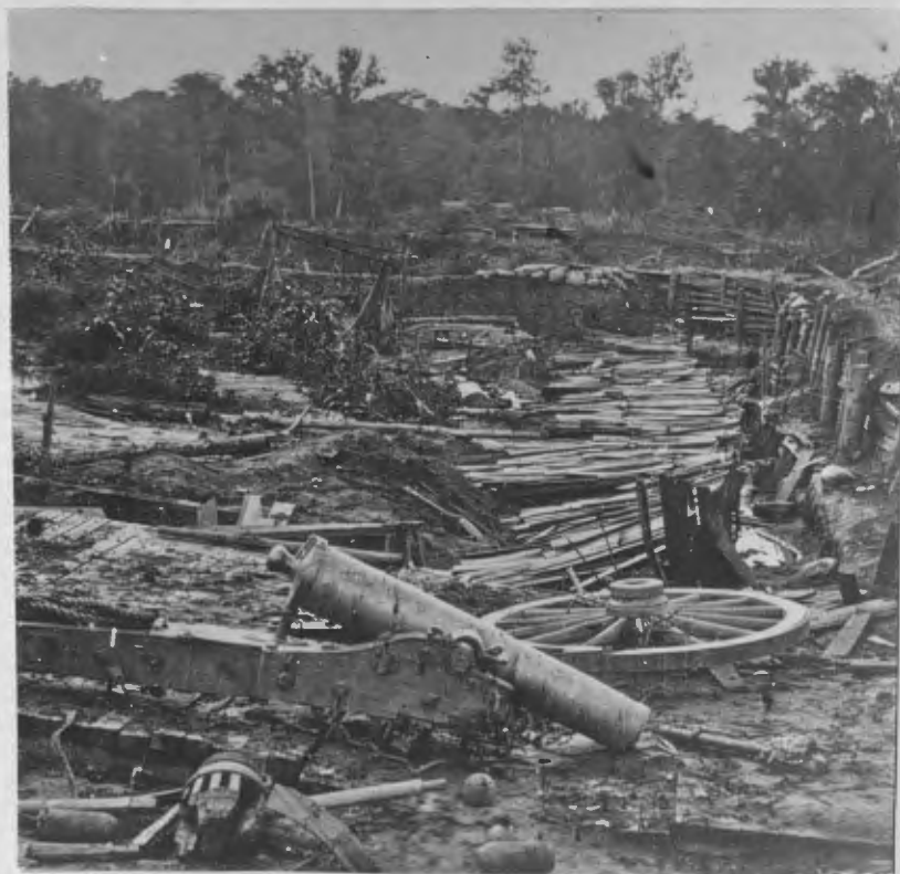
"View of rebel battery, opposite to Capt. Bainbridge's battery on our right of line-