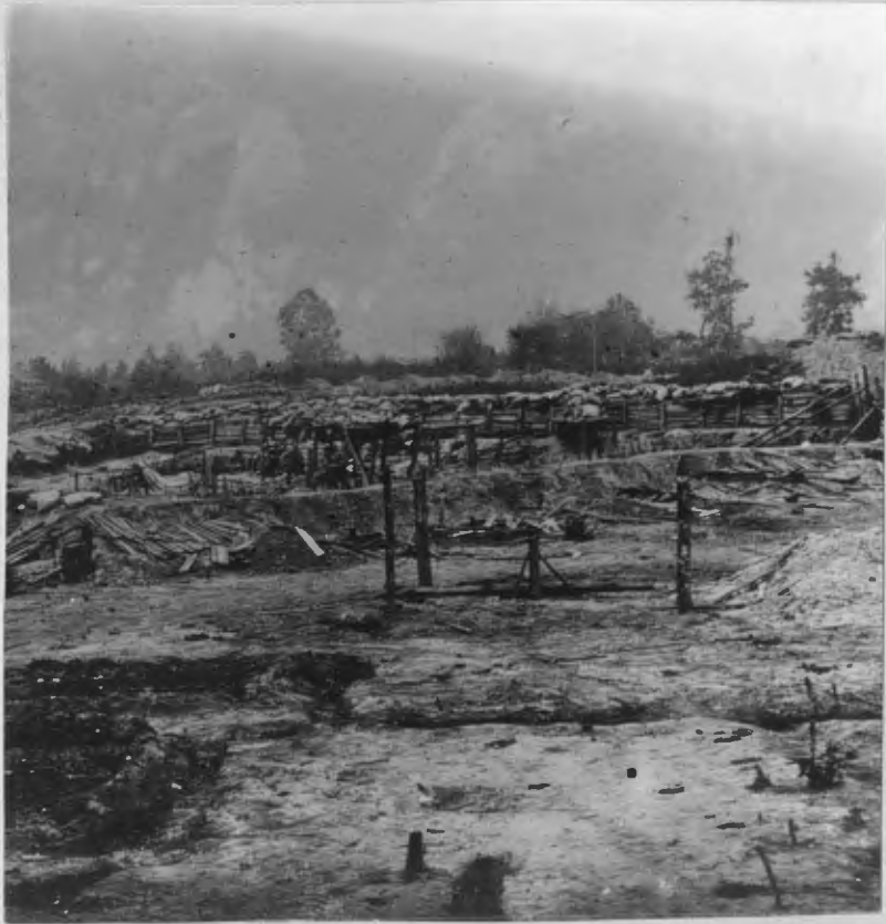
"View of Priest Cap rebel works. Port Hudson, La."