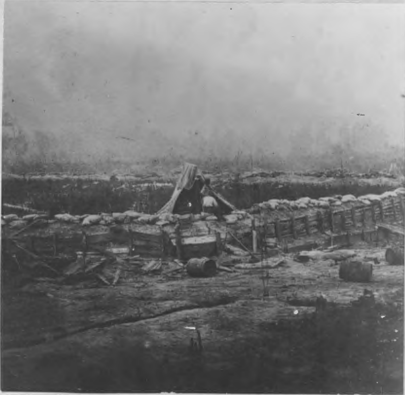
"View of Priest Cap, showing lines of our sap etc. approaching thereto-Port Hudson, La."