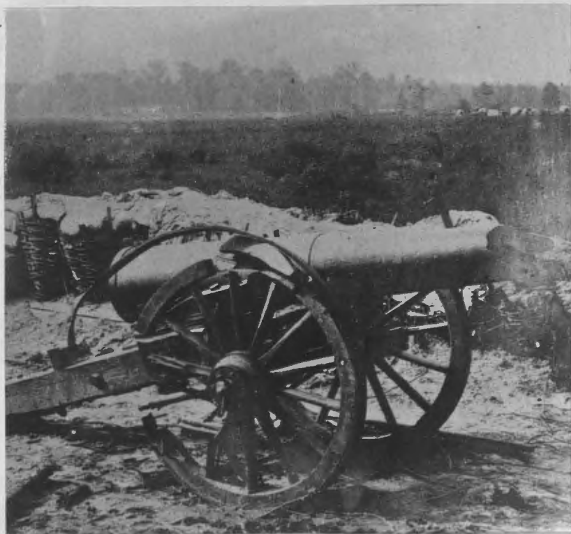
"View of Rebel Gun opposite Holcroms battery- Port Hudson, La."