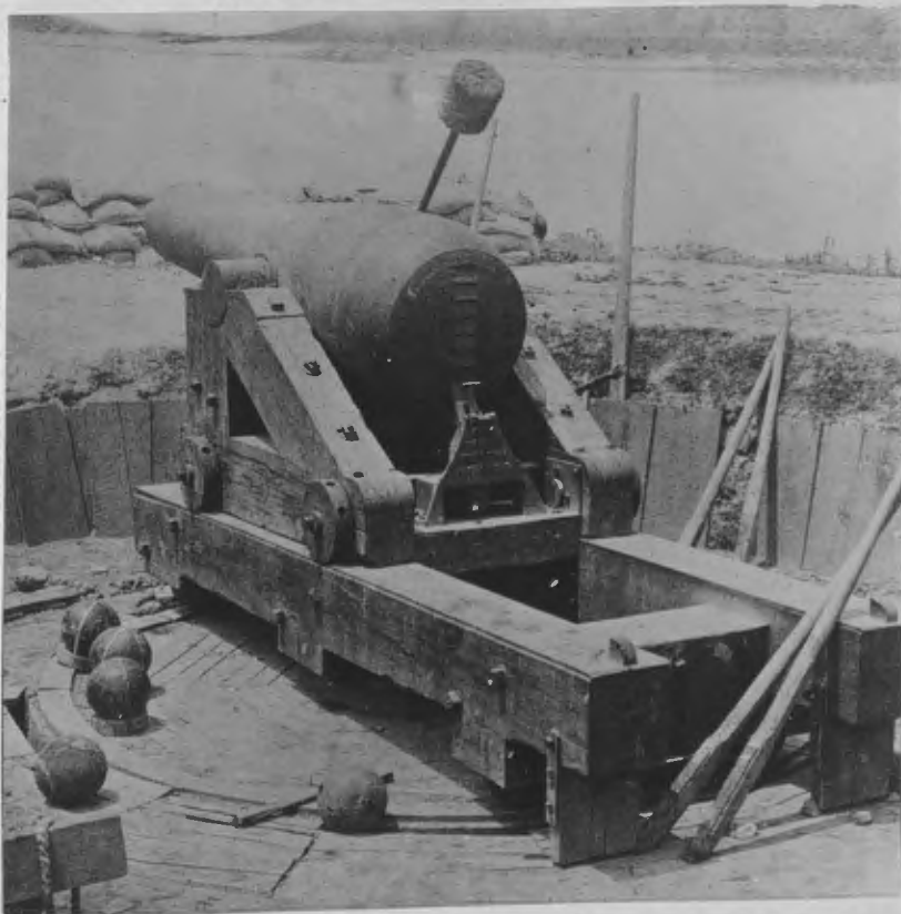
"View of large gun (9 inch bore) on river front near to the S.S. landing. Port Hudson, La."