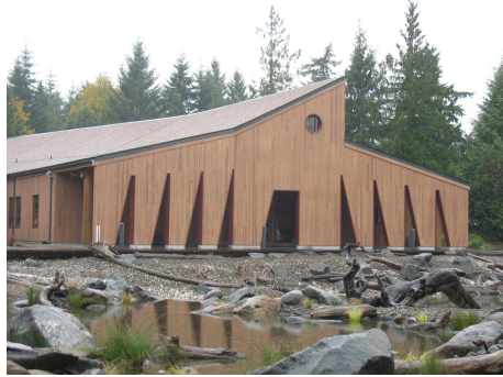
Figure 5: The MLRC front entrance

performed. With the construction of the building ending in July of 2001, newly-hired MLRC staff turned their attention to the interior design.