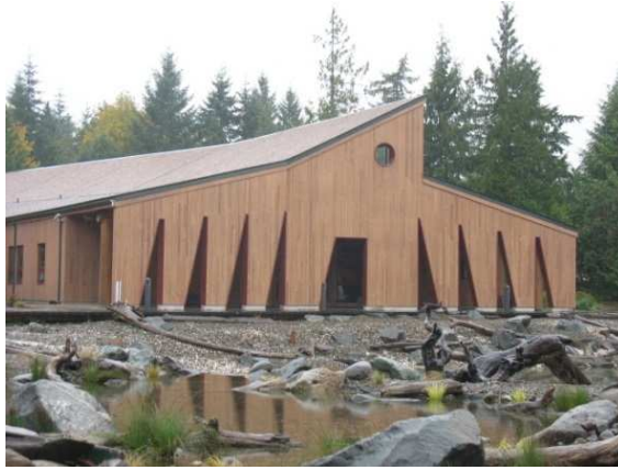
Figure 2: The MLRC

The Squaxin Island Tribe Museum, Library and Research Center (MLRC) is a relatively recent project for the Squaxin Island Tribe, as 2012 marked the completion of the final stages of the original planning. However, according to the MLRC Director, it was always a dream of the elders to build a museum for future generations of Squaxin Island people since before the tribe officially reorganized in 1964 under the Indian Reorganization Act (IRA) of 1934. 9 In 1993, the Squaxin Island Tribe Heritage and Cultural Advisory Committee, whose members assisted tribal department directors with cultural program development, planned for the new museum. By February of 2001, the MLRC completed its 501 (c) 3 or federal non-profit status application, formed the Board