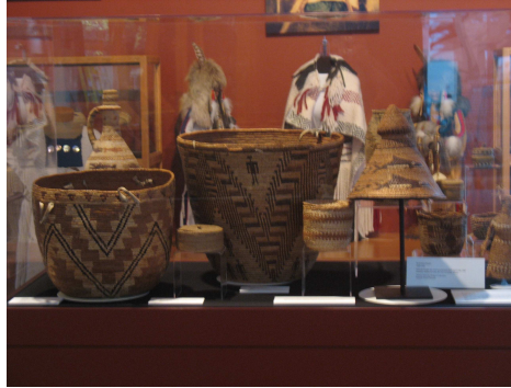
Figure 11: Baskets from the Bridges/Gottfriedson Collection, 2012

items from this collection, as well as highlighting background information on Bridges and Gottfriedson.