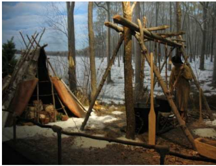
Figure 19: Four Seasons Room, Summer