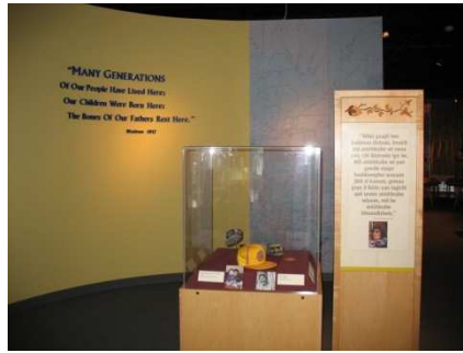
Figure 22: The end of the first exhibit