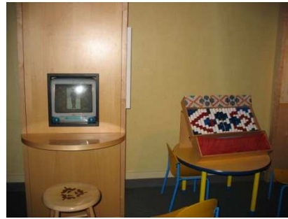
Figure 25: Ojibwe language kiosk and beadwork station

As the visitor proceeds, he or she notices the large glass wall cases to the right highlighting pieces from the Ayer collection including beaded leggings, a bandolier bag, cradleboard, roach, birchbark containers and canoes, pipe bag, potter jar, buckskin dress, porcupine quill containers, among other items and information about the Ayers and their collection with enlarged historical photographs from the MHS Photograph collection. A Mille Lacs veterans' exhibit entitled, " Modern Warriors " is located directly across from these cases. To the right, small wooden plaques of all of the veterans who served in all of the wars are attached to the wall; below is a table with more information and photographs, as well as phones to hear voices of veterans talking about their experiences.