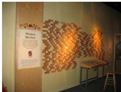
Figure 27: Modern Warriors exhibit

The next exhibit area is entitled, “ Nation Within a Nation ,” focusing on tribal sovereignty and nationhood. It is a circular space with a central round table and stools. In the middle of the table is a standing large panel display with historical information in the middle (although sometimes this panel display is placed on the floor). Flip cards with questions and answers about the meaning of sovereignty and treaties for instance are placed around the table. To the left is an area about the contemporary community,