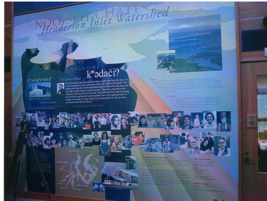
Figure 7: First panel, 2012