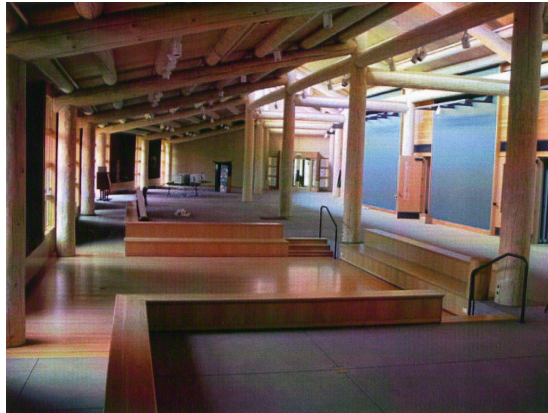
Figure 6: Empty interior, winter/spring 2002

In 2001, National Endowment for the Humanities (NEH) awarded the MLRC a substantial grant for the initial exhibit design phase entitled “The Squaxin Island Tribe ‘People of the Water’ Exhibit.” For the first year, the MLRC designated some funding to museum planning and hired a tribal member as museum curator; however, due to the delay in hiring staff and uncertainty over exhibit content, the building remained virtually empty with the exception of a small double-sided five-panel exhibit entitled “The People of the Water” about tribal history. Meanwhile, while the library staff person developed the library and gift shop portions, the MLRC hired outside consultants to assist the curator in developing the exhibits.