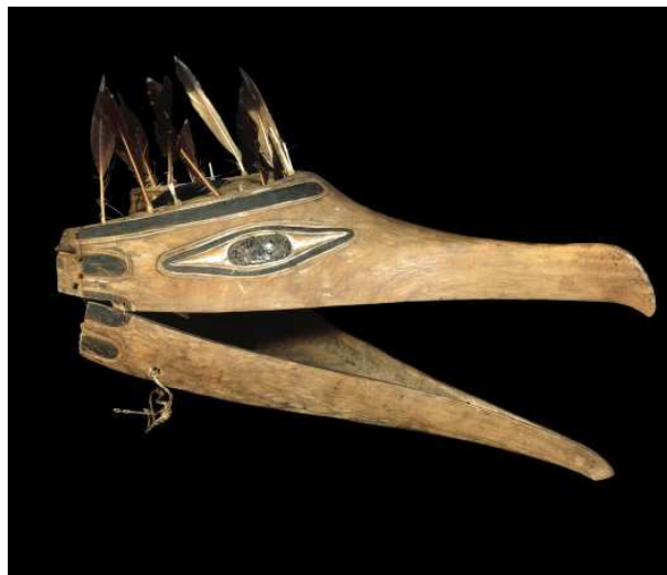
Figure 1: Alderwood Gull Mask

The pose of this “Alderwood Gull Mask” from the Pacific Northwest is displayed in a traditional manner: it is isolated, drawing attention to its singularity and its