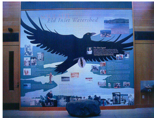
Figure 8: Third panel, 2012