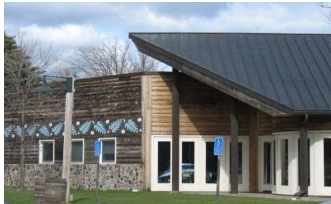
Figure 15: Side view of MLIM front entrance, April 2012