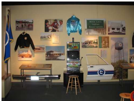
Figure 29: Nation Within a Nation

Across from this display is a large map of all tribal nations in the U.S., Mille Lacs tribal license plates, and an interactive display on sovereignty in which visitors are asked what their rights are if they are citizens of a sovereign nation. To the left of this map, are chairs and a table with booklets on treaties, the 1837 treaty conservation code, and a compilation of a few newspaper articles about the treaty rights case won by the band in