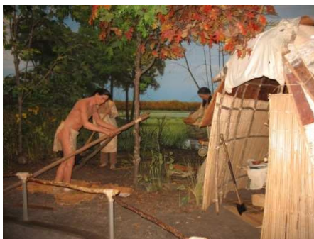
Figure 17: Four Seasons Room, Fall