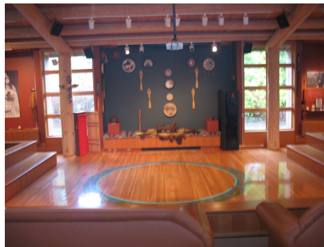
Figure 10: Storytelling area, 2012

As for the storytelling area with built-in seating, a Squaxin tribal member painted a large circular Coast Salish design. We decorated the niche in this area with various works of art, such as paintings, masks and drums completed by tribal people in the area.