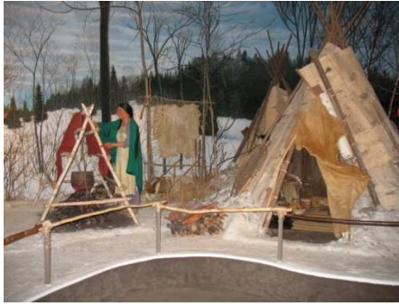
Figure 18: Four Seasons Room, Winter