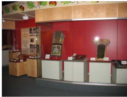
Figure 26: Ayer Collection, April 2012

Another panel label and a display case with a uniform are located to the right of these plaques, along with a large photomural of veterans walking with flags in a Grand Entry procession at a powwow.