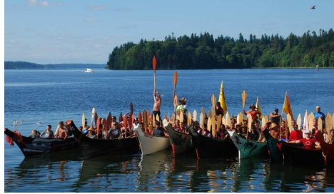
Figure 4: Paddle to Squaxin, 2012

“We are such a small tribe that struggled for so long to stay alive...But our people held on. The teachings of our elders were strong enough to maintain our future. Now we have all this positive energy from hosting the canoe journey to carry us into the future.” –Charlene Krise, Squaxin Island tribal member 1