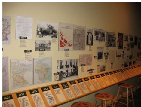
Figure 20: Timelines, 2012

Walking to the left of the canoe, the visitor then sees a small exhibit on Food and Medicine with samples of medicinal plants, such as Ogosimon (Squash Rings) and Mashkiigobag (Labrador Tea), enclosed in a custom-built wooden display case with labels in Ojibwe and English. To the right of this display, a large chronological timeline of Mille Lacs Ojibwe history begins with a label on the occupation of the Dakota in the area prior to Ojibwe settlement in 1750 and ends with the year 1999. Stools are located beneath the timeline for comfort while reading. Maps, diagrams, historical photographs, and small labels supplement the timeline on the wall. Positioned near the timeline is a large glass vitrine with a small diorama of a pre-contact Ojibwe village with archeological fragments found at the “Big Lake” (Mille Lacs).