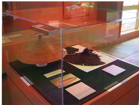
Figure 9: Wetsite cedar hat reconstruction, 2002

delicate partial baskets, cedar hats, hunting and fishing tools, stakes from fish traps, and nets into display cases alongside nineteenth and early twentieth century replicas of similar items on loan from the Burke Museum and contemporary tools used by tribal members for hunting, fishing, and gathering. We simultaneously displayed the historical and contemporary objects together as much as possible to illustrate the continuity of traditions practiced by Squaxin Island tribal people today. 53 The SPSCC and the Squaxin Island Tribe Cultural Resources Department hired a local artist from a nearby tribe to construct a contemporary cedar hat replica to be placed alongside a partial hat found at the wetsite.