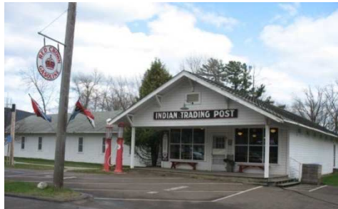
Figure 14: The Trading Post today, April 2012

transformed into the Grand Casinos in 1991 and 1992, both complete with a restaurant, hotel, convention center, and an entertainment space, which brought more tourists to the area and drastically shifted the local economy. According to anthropologist Jennifer Stampe, with these developments MHS and the Mill Lacs Curriculum Committee became further determined “to tell a new story...to emphasize dynamism and change.” 11 It was then that they conceptualized the building plans into an actual physical building. The old building closed in 1992 and shortly after, construction on a 22,810 square foot building began with a museum opening scheduled for 1996.