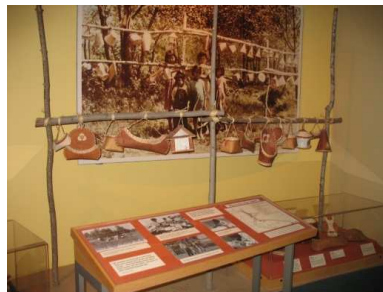
Figure 31: Replica of roadside stand (author's photo)

displayed in the old museum in an exhibit entitled “Hunting Meant Food to the Indian.” 17 The current exhibit, organized by season, has eliminated the outdated references of the old exhibit and implemented the use of the Ojibwe words and personal narratives of Mille Lacs Band members about subsistence and occupations. The old tools are placed next to contemporary ones, such as carved wooden fish hooks and twine and modern nylon fishing twine and lures used by band members today. One particularly compelling display is a replica of a roadside stand of birch bark birdhouses and other birch bark items, which are a distinguishable feature in the history of the Mille Lacs Ojibwe economy. The exhibits end with the Ojibwe phrase “Gagwe gikendadaa gaapi izhiwebak,” which is translated, “Learn About Our Past: The Story of the Mille Lacs Band of Ojibwe.” 18 After touring the exhibits, I wondered what visitors learn about the Mille Lacs Ojibwe story and whether or not it resonates with them in the way it was originally intended by the 1980s Mille Lacs curriculum committee and MHS staff involved in the planning process.