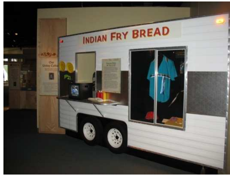
Figure 23: Our Living Culture

The fry bread stand text panel introduces the content of the entire area: the origin and meaning of contemporary powwows and regalia. To the right of the stand, is a crescent-shaped diorama with mannequins posed and dressed in the different types of regalia used at powwows today (in the mid-1990s). Interactive kiosks in front of the mannequins and along the walls point to a space where visitors can sit and read and press buttons on the subject of Ojibwe music and dance. Behind this exhibit gallery, television kiosks with push buttons highlight traditional Ojibwe singing by elder Fred Benjamin and the local Nay Ah Shing School singers, as well as flute music by band member Darren Moose. A display case with old hand drums and flutes is located on the back wall to the right. Next to this case, are enlarged beading looms for visitors to try and another kiosk featuring language with push buttons organized according to subject matter, including animals, days, months, body parts, numbers, family, clothing, buildings, food, etc.