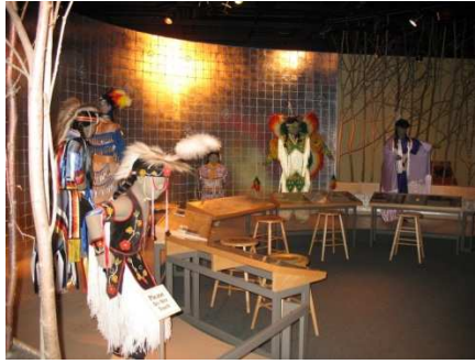
Figure 24: Powwow mannequins