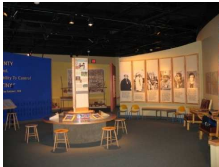
Figure 30: Panels of leaders and seating area to the right