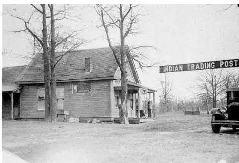
Figure 13: Indian Trading Post at Mille Lacs.