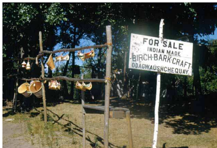
Figure 12: Birch bark basket racks, Mille Lacs. 9/2/1946, Loc. no. Collection I.69.165