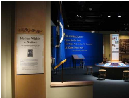
Figure 28: Nation Within a Nation

including a slot machine and a Grand Casino silk jacket, the door of a tribal police car and police coat, information about the school and clinic, and enlarged color photographs of Mille Lacs Band members and buildings, among other contemporary items and information.