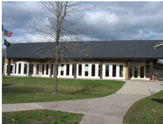
Figure 3: The MLIM