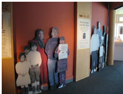
Figure 21: Our Strength and Our Hope (author's photo)

ties; the origin and distinction of the terms ‘Anishinaabe,’ ‘Ojibwe’ and ‘Chippewa;’ Ojibwe migration from the East; and the Three Districts of Mille Lacs today that includes a map. 15 Freestanding glass vitrines are located sporadically in this area and contain items such as beadwork belts, moccasins, birch bark containers, cradleboard, dolls, and a contemporary, partially-beaded baseball hat. Information about the makers, a description of uses, and historical and contemporary photographs of the makers’ families are placed in front of the objects. Interspersed among the glass cases are freestanding wooden panels with text labels containing photographs of elders and quotes, many of which are conveyed in both Ojibwe and English. A wall with a quote from [Chief] Wadena in 1912 separates this exhibit area from the next. It reads, “Many Generations of Our People Have Lived Here; Our Children Were Born Here; The Bones of Our Fathers Rest Here.”