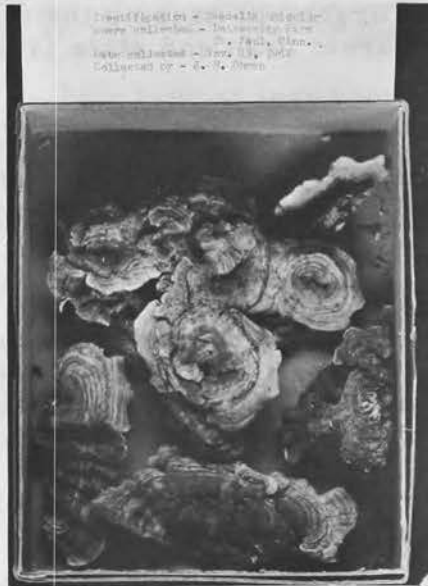
Figure 2. Dried specimens loose in box.