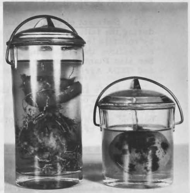
Figure 4. Fleshy specimens in liquid preservative. Identification card may be glued to container or fastened with a tag.