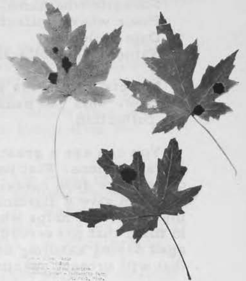
Figure 3. Specimens in Riker Mount. This cotton-filled box is about 1 inch thick. Face of mount is heavy plastic.

available commercially, in the NASCO Catalog in your county agent's office, under the trade name, "Riker Mounts" (figure 3). These ready made mounts could get expensive if you use a number of them. Therefore you might prefer to make your own.