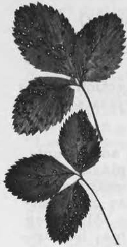
Figure 1. Flat, dried specimens mounted on heavy paper (fastened with cellulose tape).