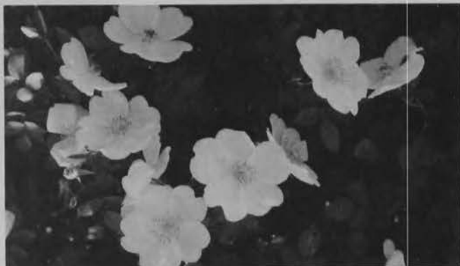
Fruhlingsanfang, a Shrub, was developed in Germany. It blooms only in June.