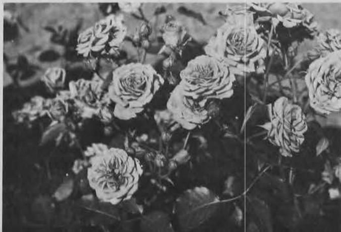
Elmshorn is an attractive Hybrid Musk rose featuring repeat bloom.