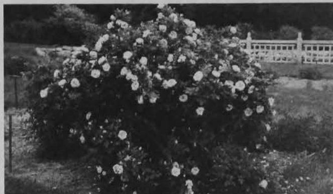
Wasagaming is a hardy Shrub developed in Canada.