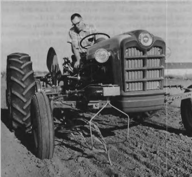
L. A. Liljedahl on a tractor equipped with the automatic pilot.

This movement closes an electric switch in the pilot mechanism, which in turn opens hydraulic valves in the power steering unit and the tractor is guided back into the proper direction.