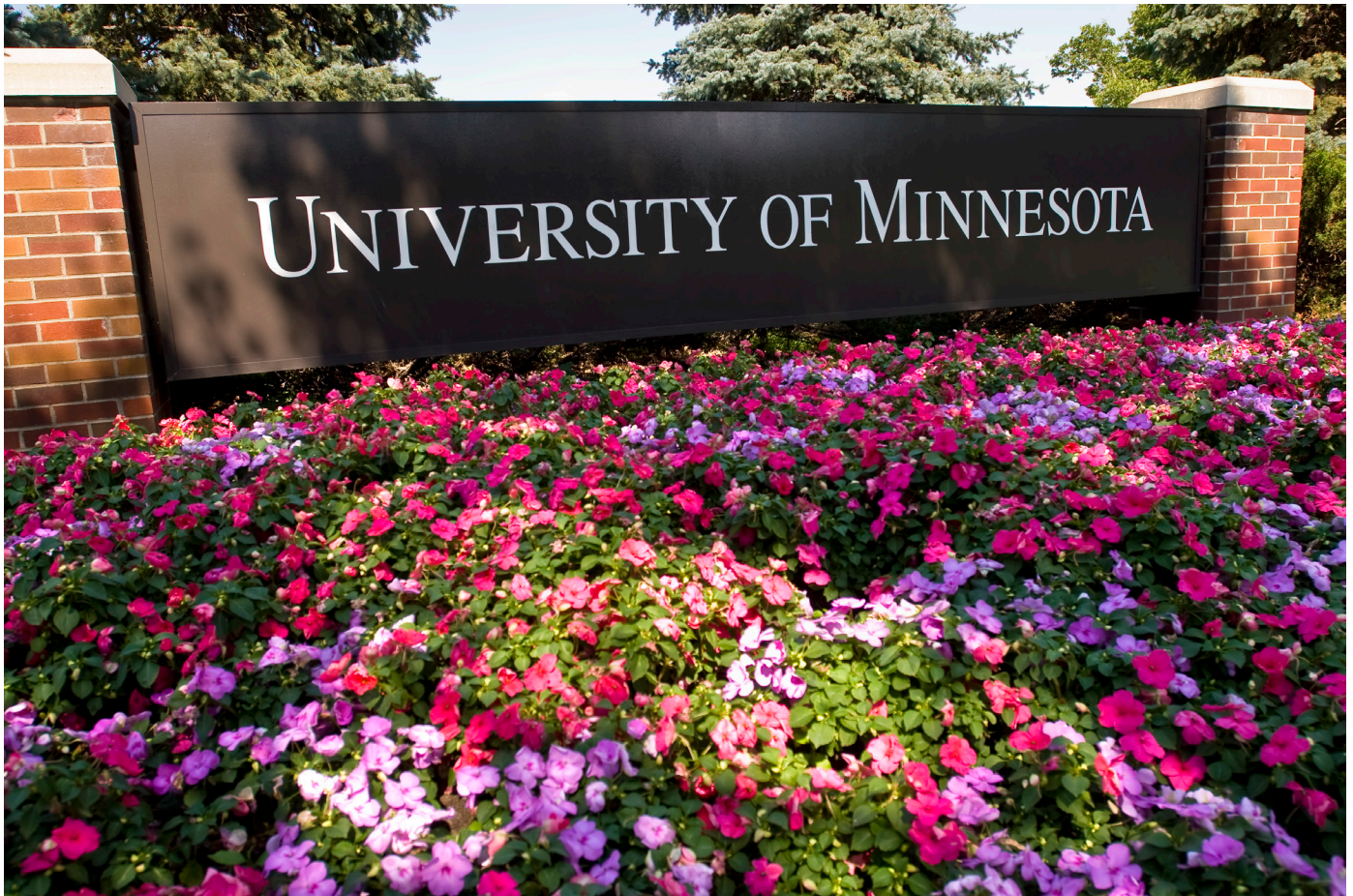
Entrance signage to the University of Minnesota Twin Cities Campus