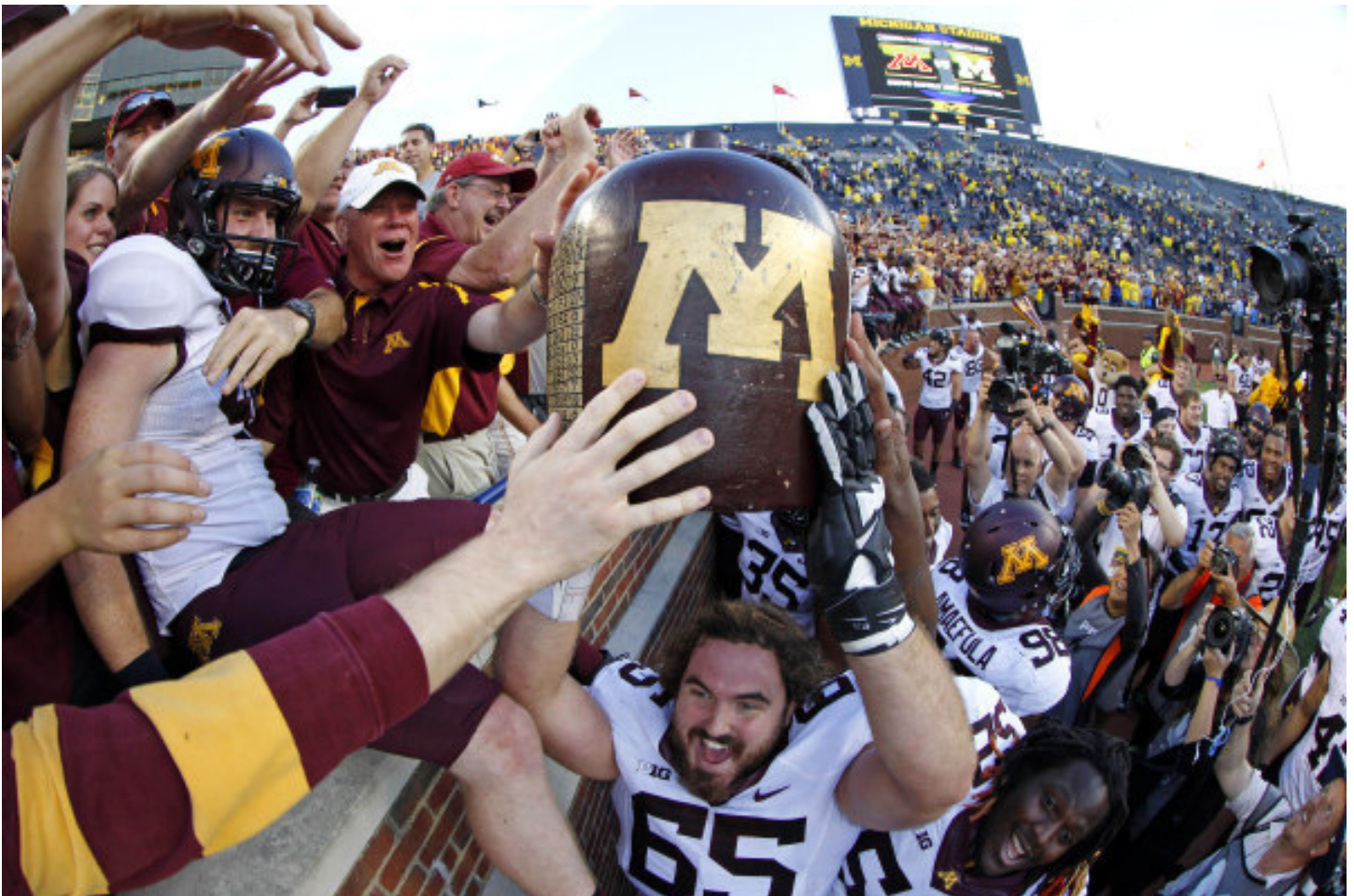
The Gophers brought home the Little Brown Jug for the 23 rd time on November 29, 2014 by defeating Michigan 30-14 in Ann Arbor.

The Athletic Compliance Office, which reports to the General Counsel, works with all of intercollegiate athletics regarding The National Collegiate Athletic Association (NCAA), Big Ten Conference, and Western Collegiate Hockey Association (WCHA) rules. This consists of working with 25 teams and over 750 student-athletes. In addition, the Athletic Compliance Office works closely with the McNamara Academic Center, Admissions, Financial Aid, and Academic Support Resources on campus. The functions of the