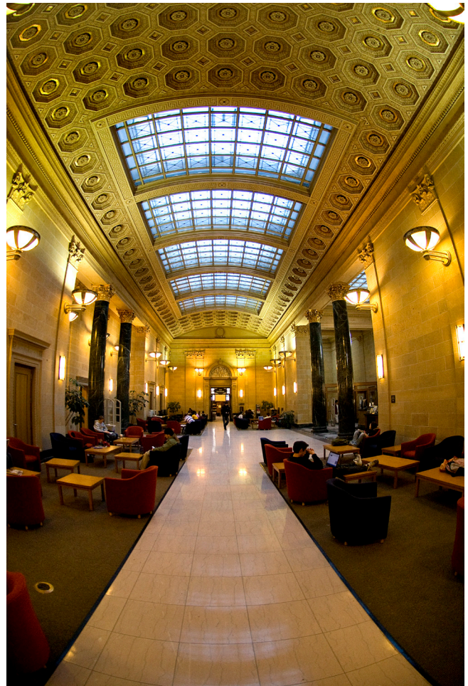
OGC worked with the University Libraries on its deal with Google making rare or out-of-print works digitally available.

An OGC attorney specializes in copyright law. OGC regularly advises faculty and students on the use of others' copyrighted works and the registration, protection and use of their dissertations, theses, and articles. OGC