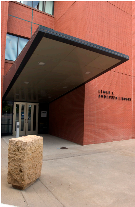
OGC recovered $9.1 million to remediate environmental contamination around the West Bank's Elmer Andersen Library and Minnesota Library Access Center (MLAC).

With respect to student issues, OGC provided representation and advice to student behavior committees and administrators on multiple campuses. OGC lawyers assisted with a number of sexual assault cases, and also provided representation and advice to scholastic standing committees and administrators involved in student academic complaints, as well as advice to the Provost regarding student appeals.