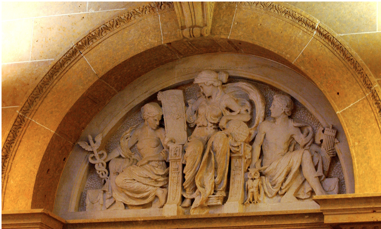
Architectural detail at Walter Library.