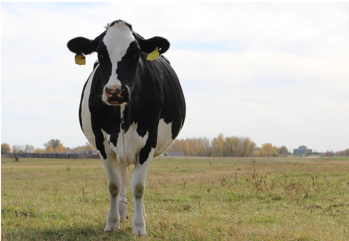
A Holstein, one of the many bovines residing at University of Minnesota Morris.

The use of in-house counsel is far more economical for the University, as costs per hour for comparable legal services performed are approximately 50% less than those of outside counsel. In addition, and beyond the issue of cost, the quality of legal services the University receives is enhanced by OGC's comprehensive knowledge of the University's particular structure, operations, strategic priorities and mission. This reduces costly preparation time that would be needed by outside counsel less familiar with the University and provides more focused counseling tailored to the unique issues facing the University. Client feedback suggests that OGC provides high quality legal services on a level at least equal to that provided by leading private firms.