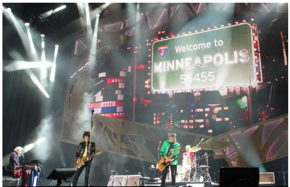
OGC advised on performance agreements to bring internationally recognized musicians to the TCF Bank Stadium.

CORPORATE SPIN-OFF. The College of Education and Human Development, in February, spun-off its Flipgrid™ operations to Vidku, Inc. The college transferred to the