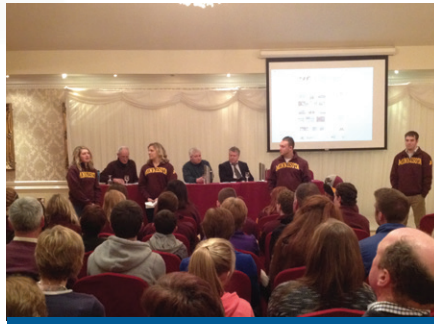
Student Business Plan Presenters