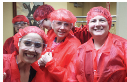
Students after their tour of First District Dairy Processing Plant