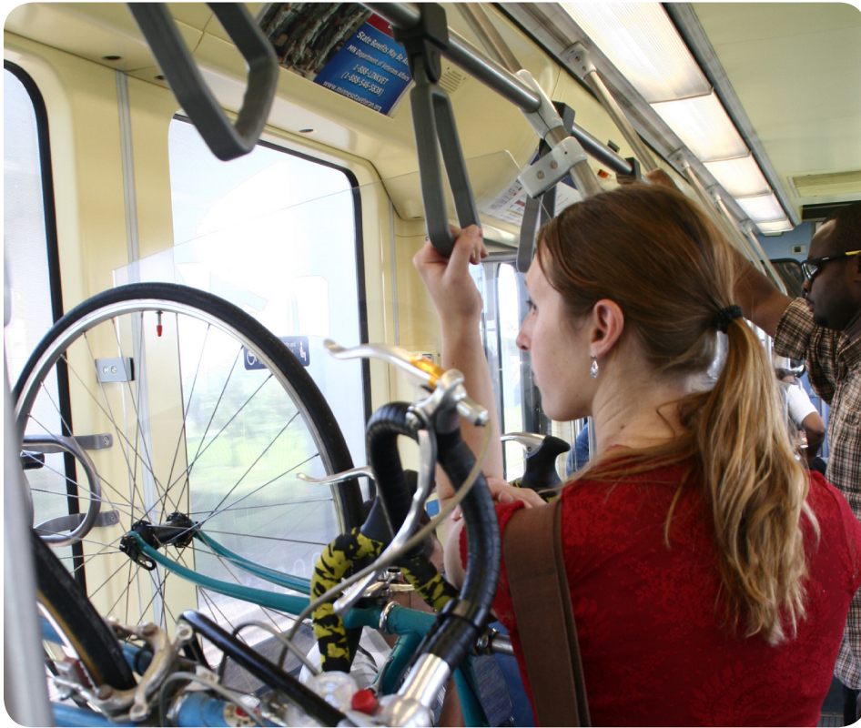
The travel preferences of Millennials could influence future transportation policies.

One of the most striking findings from a recent travel survey by the Metropolitan Council was a marked decline in the rate of daily trips per household—from 11.1 in 2000 to 8.8 in 2010. The decrease could be partially attributed to the long-term trend toward smaller household size, but researchers immediately wondered what else could explain the decline: Rising fuel prices? An aging population? Or even the impact of shifting attitudes toward travel, such as the changing travel preferences of Millennials?