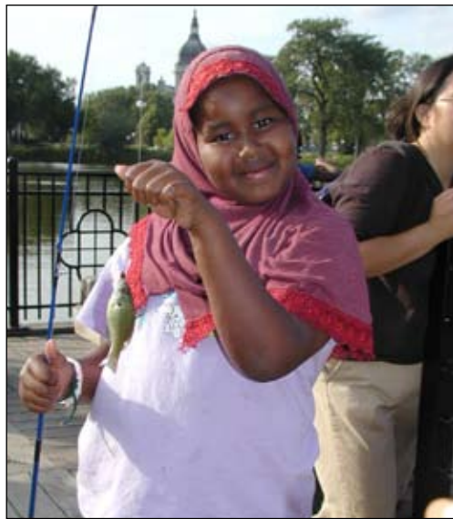
A happy angler shows off her catch.

to recent Southeast Asian immigrants on fishing regulations,” he recalls. “The catch was that they were all deaf. It took me and three translators to answer a single question.” Because sign language differs from country to country, a translator who knew the South East Asian sign language had to translate the question into American Sign Language. The next interpreter translated it into