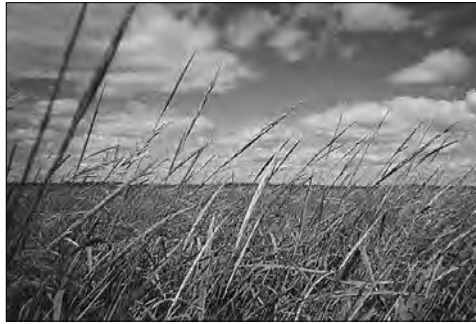
Wild rice growing in Rice Lake National Wildlife Refuge, McGregor, Minnesota.