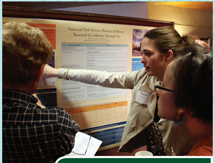
Students of RRM 4232 share their recommendations with the visiting public at the course’s poster session.

regulations. This is due to current issues of crowding, shoreline impacts, and improper waste disposal. To help the NPS better serve the public, groups on this project recommended various public involvement opportunities such as user surveys, open forum meetings, formal hearings, and engagement of a local environmental group. One recommendation also included use of the NPS’s Junior Ranger program to benefit both the park and the area’s youth.