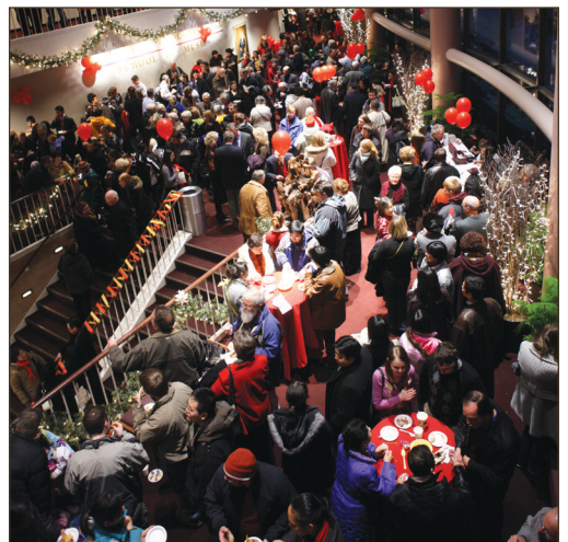
Chinese New Year celebration