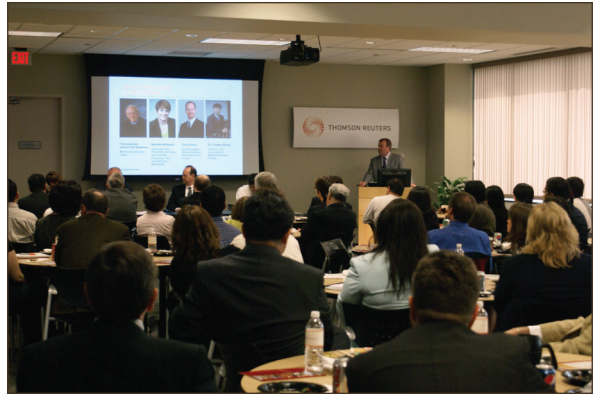
Event attendees listen to the panel discussion