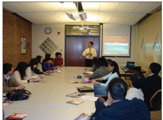
The higher education and academic English training delegation visits the University of Minnesota, Duluth.

Also in fall 2008, a delegation of 24 young lecturers and professors from well-known universities in Beijing completed a higher education and academic English training program . As part of the long-term relationship between the Mingda Institute and the Beijing Higher Education Teachers Training Center under the Beijing Municipal Government, the program aims to help young professors improve their English proficiency, learn advanced teaching methodology, understand the American higher education system, and experience American culture. The group attended tailored English courses and lectures on various higher education topics, met with University faculty members to learn teaching skills, and visited North Central University in downtown Minneapolis and the University of Minnesota's College of Liberal Arts.