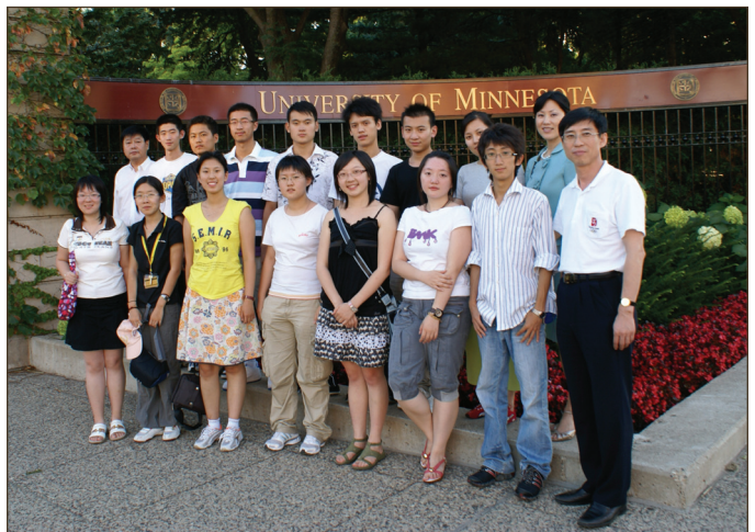
The students from Northeast Normal University High School with China Center staff