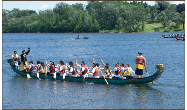
The China Center dragon boat team on Lake Phalen