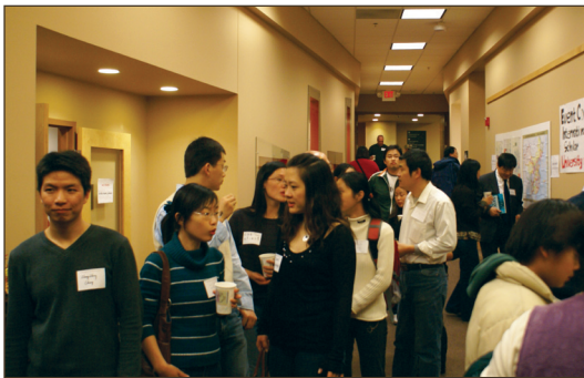
Scholars at the Fall Scholar Social