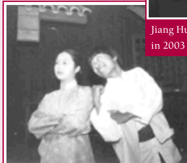
Nankai University students perform “Thunderstorm” at the U of M in 1985