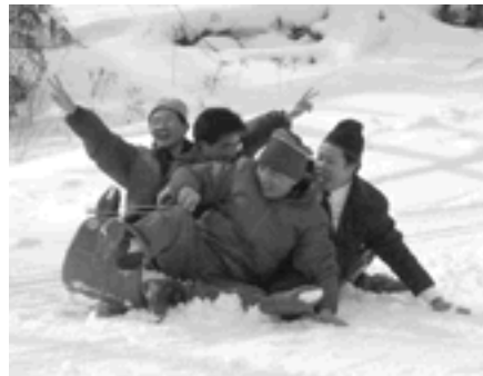
Members of the Zhejiang CEO delegation enjoy a Minnesota winter day.

The future looks bright for the Mingda Institute. The Zhejiang government greatly regarded the training program and scheduled a second Zhejiang WTO group of 26 executives for a six-month training, which began in November 2004. In addition, the Sichuan government has named the China Center as its U.S. training base and will send four short-term training delegations of mayors and commissioners to Minnesota by the end of 2004.