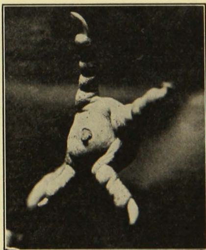
FIG. 8. BUMBLEFOOT

Bumblefoot is a swelling on the ball of the foot and may resemble a corn or a dried abscess. Whatever the immediate cause may be, it begins from