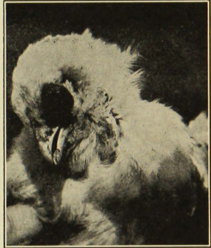
FIG. 3. YOUNG BIRD AFFECTED WITH ROUP The eye is glued shut and covered with a large scab.

Some birds with runny eyes may be helped by bathing the eyes frequently with a mild boric acid solution. Better