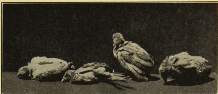
FIG. 5. BIRDS SUFFERING FROM COCCIDIOSIS

The trouble starts at about this age and continues to six or eight weeks of age.