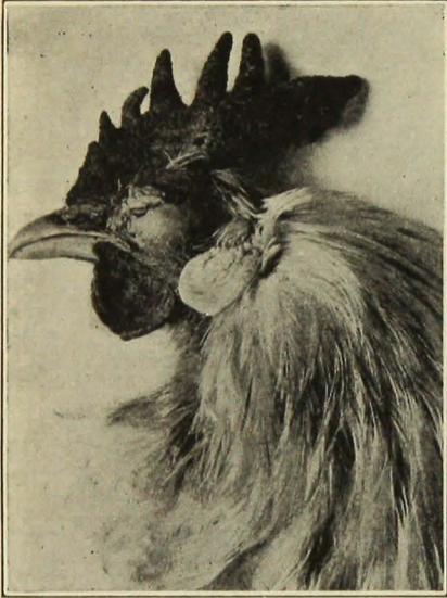
FIG. 2. ROUP IN FOWL

as a slight cold in the head. A few birds may be seen to sneeze and there may be a sticky discharge from the nose. This frequently gums the nostrils shut. On entering the henhouse in the morning when the sun shines on the birds, the caretaker may notice a