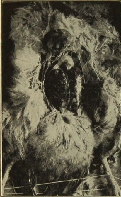
FIG. 1. PHOTOGRAPH OF A TUBERCULOUS FOWL

There is no cure for birds affected with tuberculosis. Preparations guar-