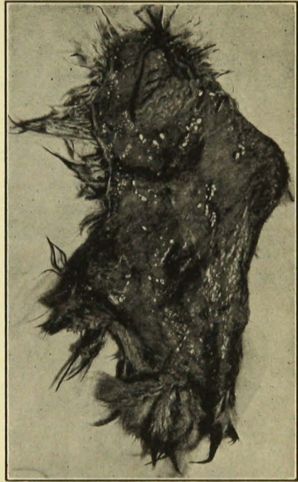
FIG. 7. WHITE SEED-LIKE BODIES UNDER THE SKIN

These are white or yellowish-white cucumber-seed-like bodies found under the skin of most farm poultry. They are the remains of connective tissue mites. They rarely cause the death of a bird, and most farm folks are not aware of their presence until they happen to see them when preparing a bird