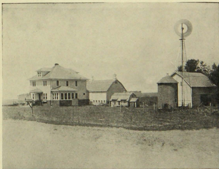
A Well-Planned Farm Home