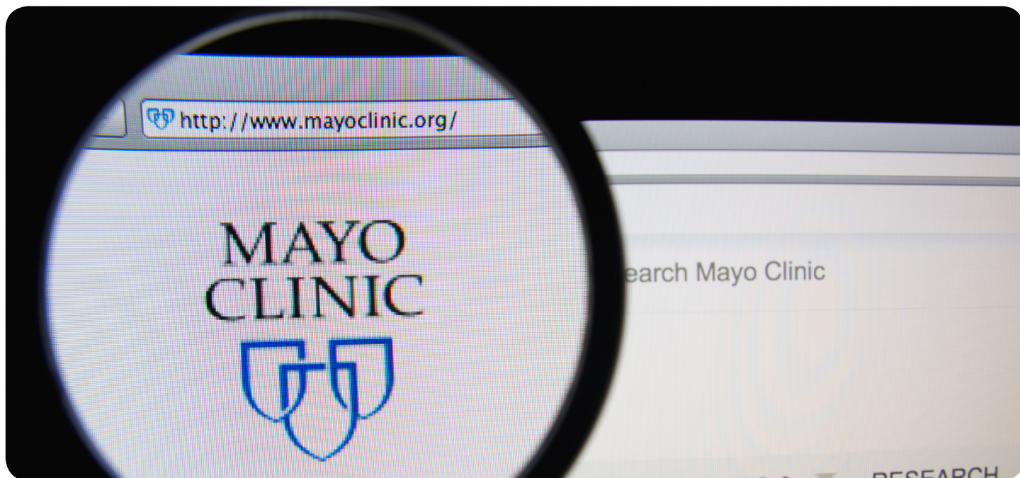
Mayo Clinic anchors an industry cluster in southeastern Minnesota..