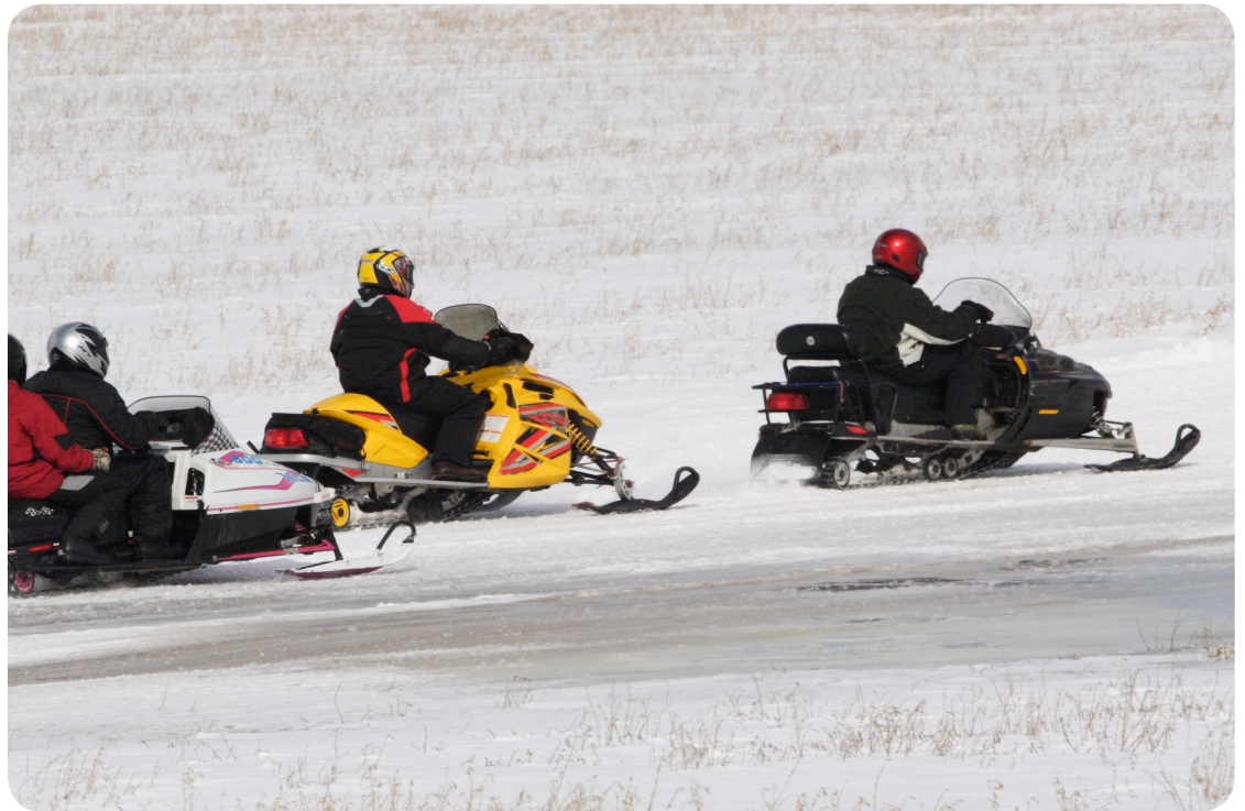
One industry cluster important to northwestern Minnesota is recreational vehicle production.