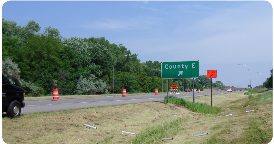
A roadside drainage ditch along a Minnesota roadway

Next, researchers developed and tested a filtration system that can be installed in swales to provide significant treatment of dissolved heavy metals and dissolved phosphorus in stormwater runoff, along with a model that can predict the reduction of these pollutants that can be achieved using the filter.