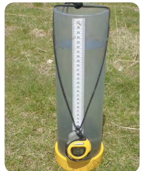
Researchers measured the water infiltration rate at five swales.