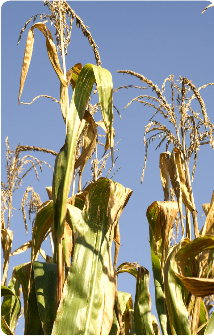
Corn rows left standing after fall harvest become a living snow fence.

Cornstalks may not be the first thing that comes to mind for keeping rural roads clear in the winter. But when stalks near roadsides are left standing after fall harvest, they become a living snow fence, reducing the amount of snow blowing onto roads.