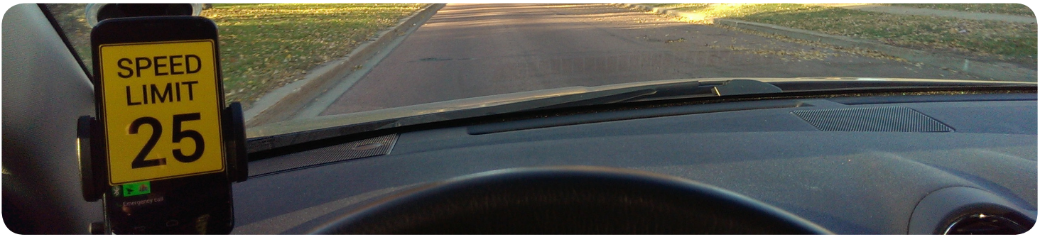
Demonstration of a TDSS speeding alert. When the driver is following the posted limit, the display background is white.

To help teen drivers stay safe on the road, researchers at the U of M's HumanFIRST Laboratory have been working for nearly 10 years on the development of the Teen Driver Support System (TDSS). The smartphone-based system is a comprehensive application that provides real-time, in-vehicle feedback to teens about their risky behaviors—and reports those behaviors to parents via text message if teens don't heed the system's warnings.