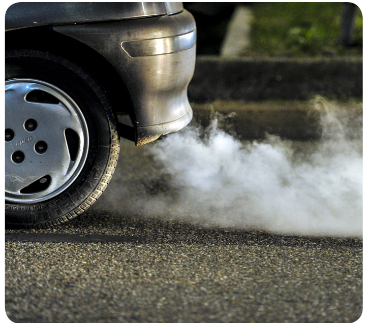
Boies plans to conduct research on advanced technologies that can be used to reduce emissions.

To read an expanded version of this Q&A, visit the CTS Conversations blog at blog.cts.umn.edu .