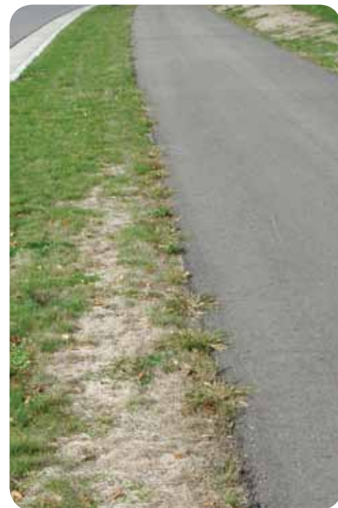
Typical roadside damage to turfgrass can be caused by salt, heat, and drought.