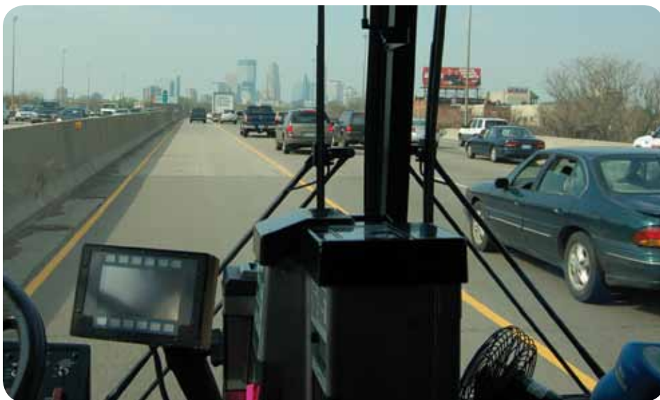
The driver-assist system was designed to help drivers safely navigate bus-only shoulder lanes.

"I'm pleased that the evaluation documented a measurable improvement in driver performance," Abegg says. "The fact that bus operators had a positive reaction overall is also encouraging for the adoption not only of this specific technology, but the wide spectrum of connected-vehicle technologies that are on the near horizon."