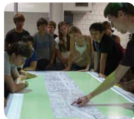
High school students view the interactive planning table at the Minnesota Traffic Observatory.

More about the labs and Gridlock Buster is at its.umn.edu .