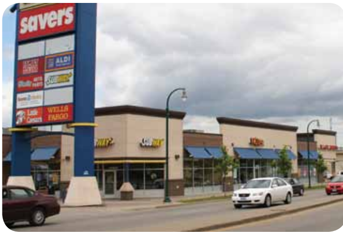
The study found that highly accessible destinations with a wide variety of available services are more appealing to shoppers.