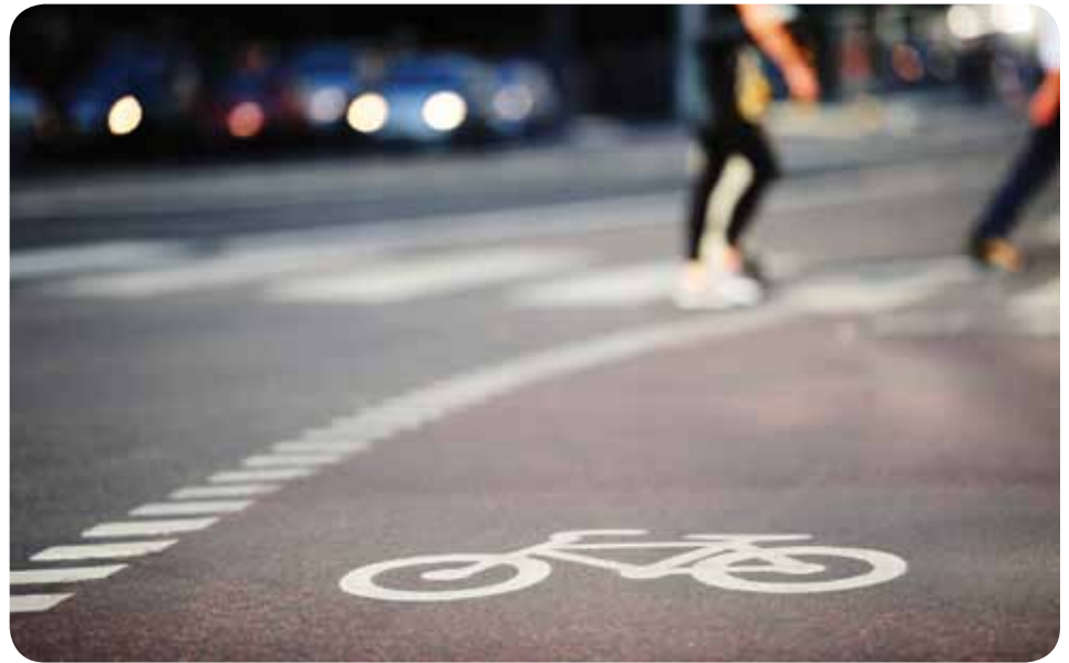
The robotic prototype can automatically paint words, arrows, and symbols on roadway surfaces.

Currently, maintenance workers use stencils and paint rollers to manually apply messages and symbols to the roadway. The robotic device could help workers complete painting operations more safely, quickly, and efficiently—requiring fewer workers and less time spent on the road. It could also improve the flexibility of painting