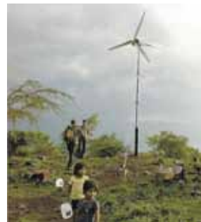
Innovative Engineers designed and built a wind turbine in La Hermita, Nicaragua.

In addition to the Nicaraguan project, IE members hosted University of Mexico students for two months this summer while together they worked on a wind turbine project design.