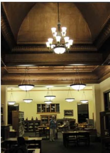
Dickinson Public Library, North Dakota

My favorite, the Intellectual Freedom Panel, was a lively, well-attended discussion of censorship in libraries and academia. Another highlight was the reception at the Dickinson Public Library. The renovated fireplace and beautiful tin ceiling in the oldest part of the building were particularly impressive.