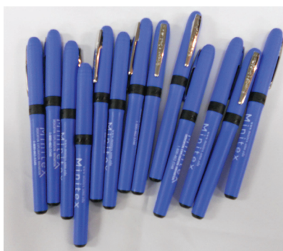
The famous Minitex pens we hand out at the booth each year