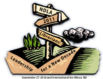
September 21-24 Grand International Inn Minot, ND

The Library of Congress has agreed to employ the Resource Description and Access (RDA) guidelines beginning next year. With this change from AACR2 comes the requisite training and orientation catalogers require to fully exploit the new cataloging rules. This pre-conference session will introduce experienced catalogers to some of the finer points of RDA, concentrating on the general process of describing library resources and applying access points. Opportunities for hands-on exercises and discussion will be provided.