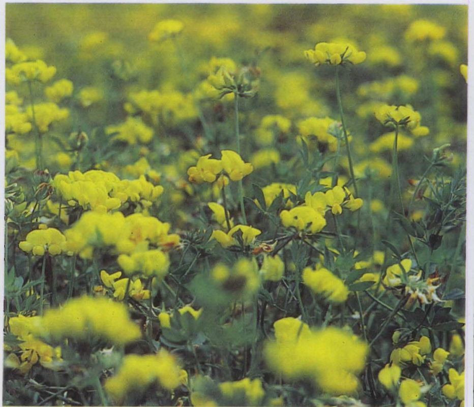
Birdsfoot trefoil is a useful pasture crop scientists would like to improve.

Plant breeders must have a source of desired characteristics to develop improved varieties. Since all known varieties of birdsfoot trefoil have a strong