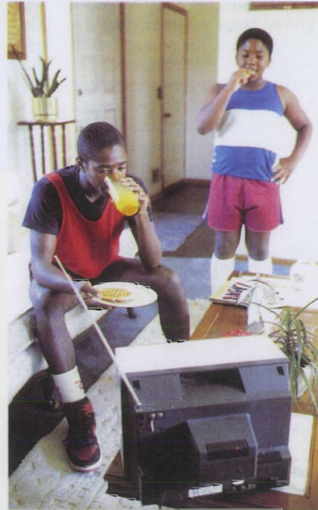
A study shows that latchkey youths frequently enjoy their independence.

Latchkey children are those who are on their own, or in the company of their brothers or sisters, from the time that school is over till their parents come home from work. Their numbers have