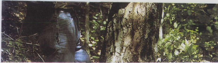
Don DelGreco, of the Rochester office of the Minnesota Conservation Corps, measures trees in a study to track the health of the forest.