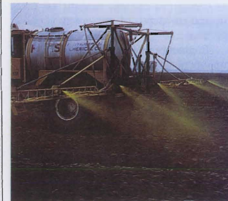
The new water quality research center will help determine sound agricultural practices.

intensive—we need to have people out there sampling every time there is water moving through the soil," Anderson says. They plan to start studying crop rotations next spring, after spending this year minimizing the chemical inputs at both sites.